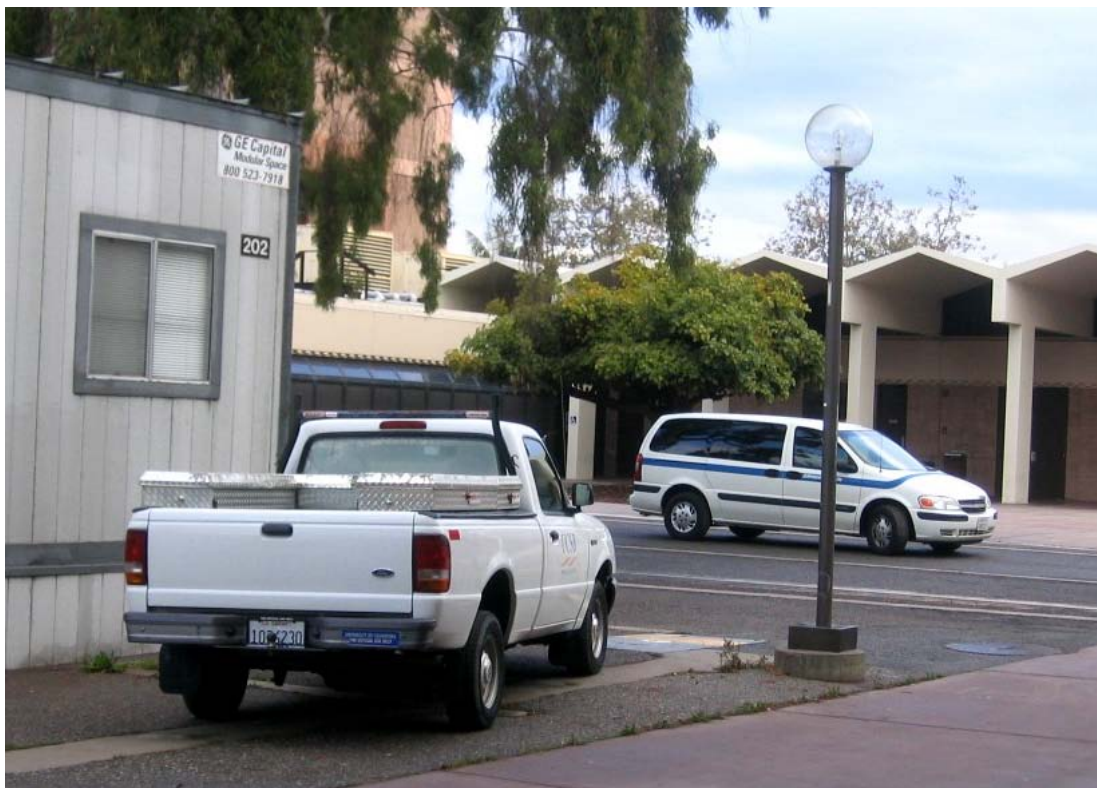
Two vehicles parked on the walkway to the southwest of the Chemistry Building, around 8:30 AM on October 18, 2005.