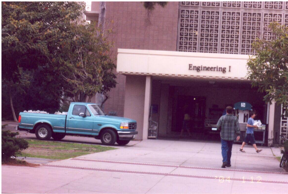
And of course the Daily Nexus distribution truck continues its early morning grand tour of the campus walkways; it is shown here on 2004/01/12 to the west of Engineering I.