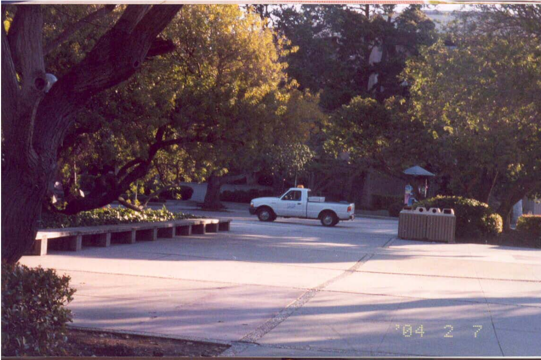
Truck driving northward on the walkway to the west of Davidson Library, right past a sign announcing that no bicycles are allowed in the area (2004/02/07).