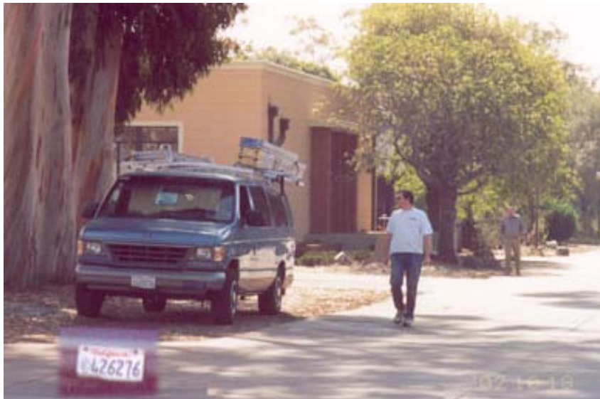
2002/10/18, around noon: Vehicle parked to the northwest of Webb Hall