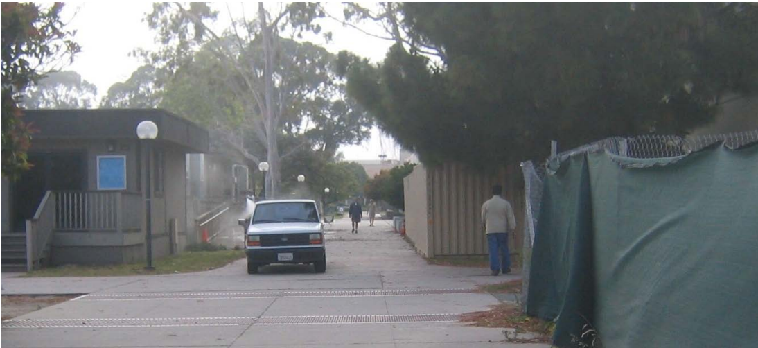
Light truck moving toward the west end of the Engineering I building around 6:00 PM on June 13, 2005.