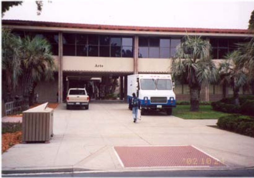
2002/10/24, around 8:30 AM: Vehicles parked on the north side of the Arts Building (the corner adjacent to the bike path and Storke Tower).