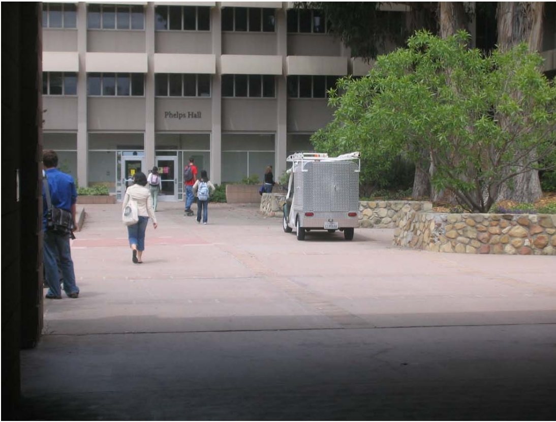
Vehicle driving from the south of Phelps Hall, through the covered walkway, and into the courtyard, around 2:00 PM on May 4, 2005.