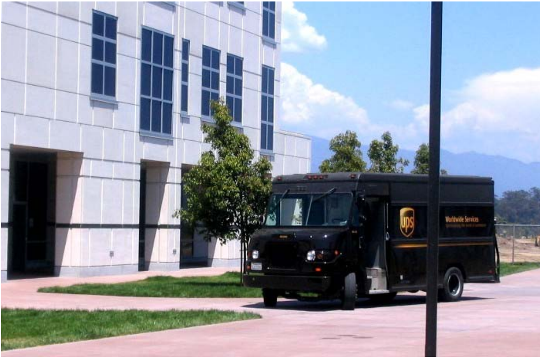
UPS truck parked on the walkway to the south of the California Nanosystems Institute Building, around 2:00 PM on 7/21/2006.