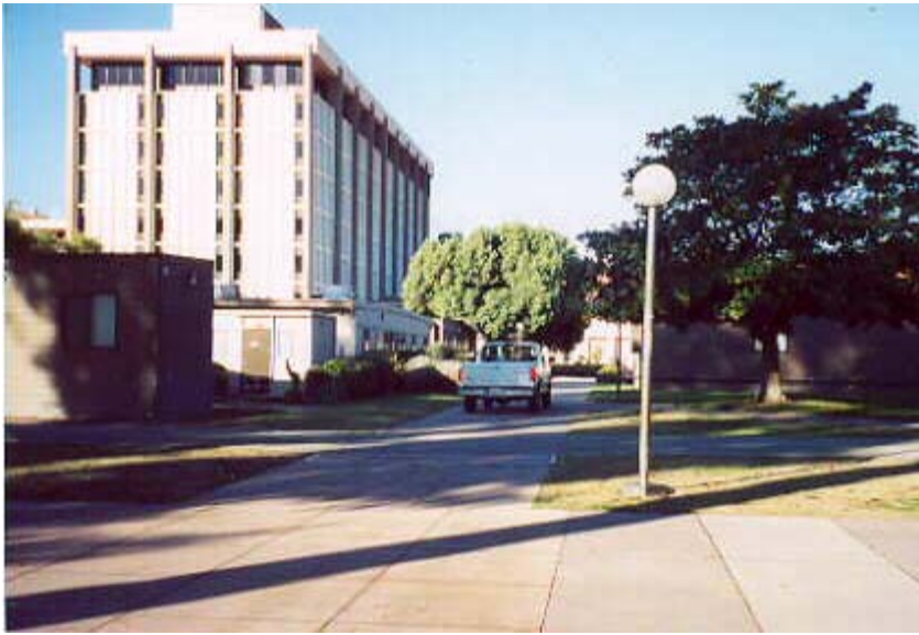
Truck driving from the south side of Broida toward the Davidson Library on 2003/11/4.