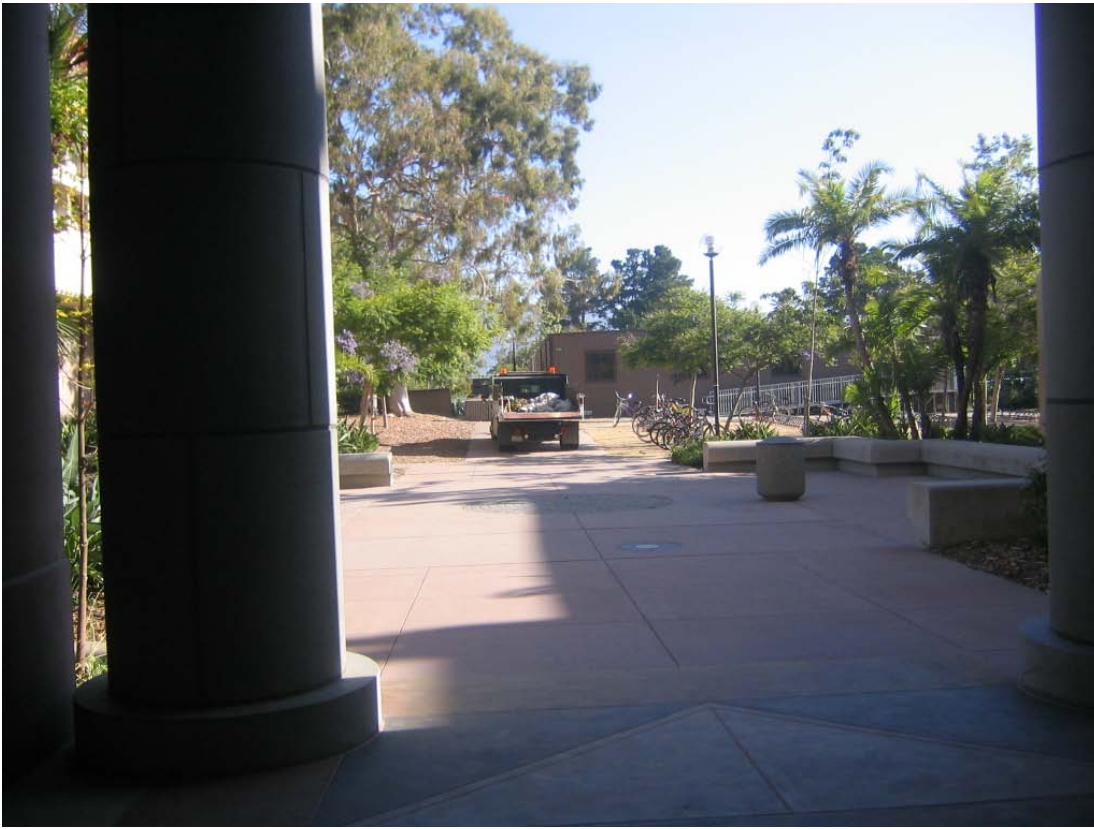
Truck driving on the walkway to the north of the Physical Sciences North Building around 8:30 AM on June 7, 2005.