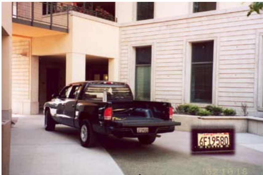
2002/10/18, around noon: Vehicle parked in the Bren Building courtyard.