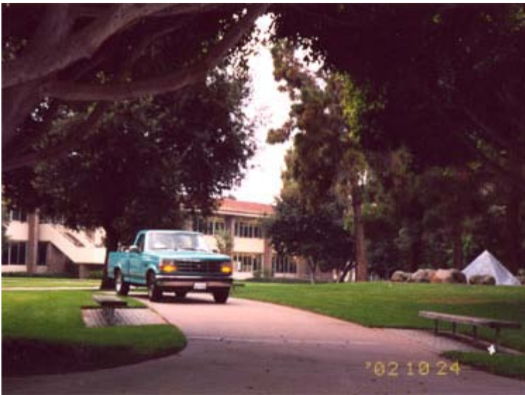
2002/10/24, around 8:30 AM: Truck taking a long and winding path on walkways as it stacks the Daily Nexus in numerous racks around the campus. Here, it is shown to the northeast of Davidson Library, going toward Buchanan Hall.