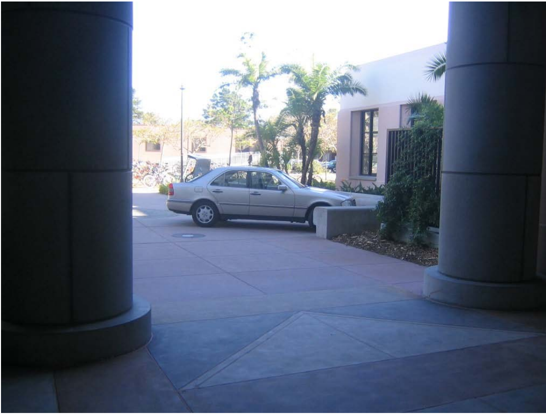
Early morning on March 31, 2005, looking north from the walkway passing under the Physical Sciences North Building.