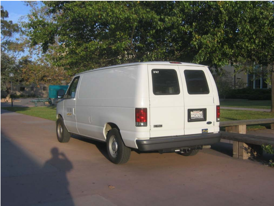
Van parked on the walkway to the south of Broida Hall around 7:00 PM on May 17, 2005.