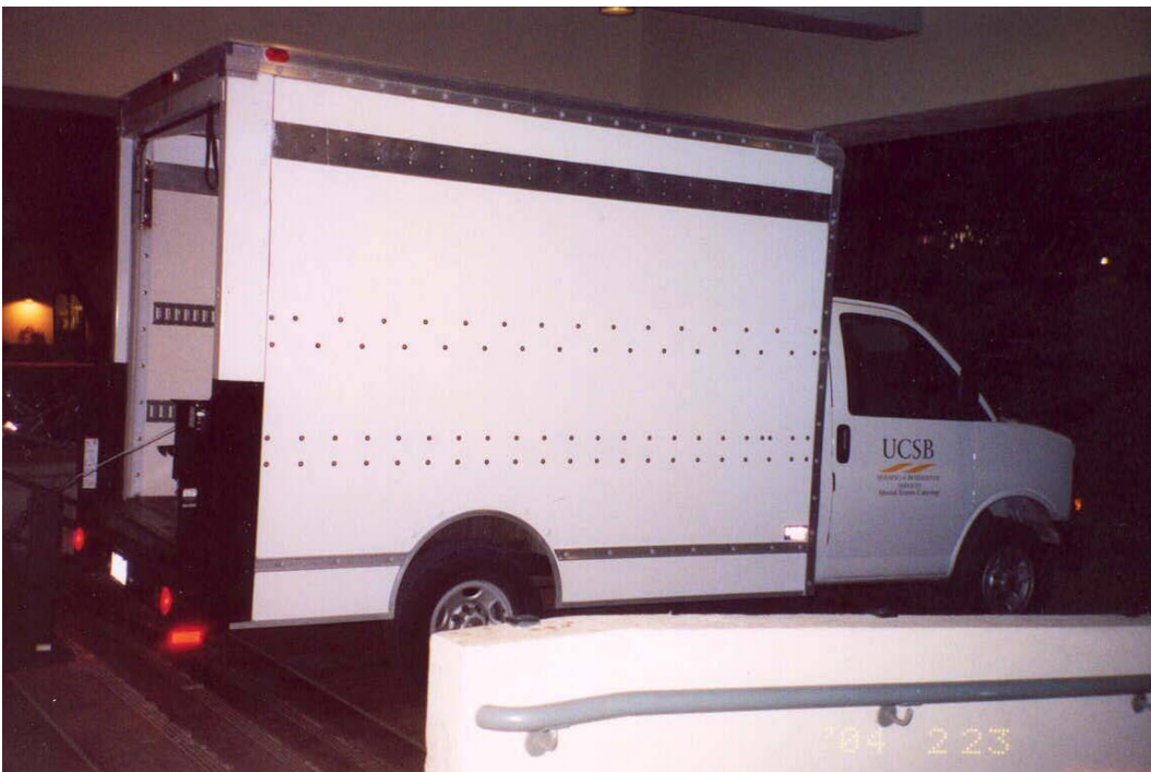
UCSB Dining Services van parked next to the steps to the west of Engineering II (2004/02/23).