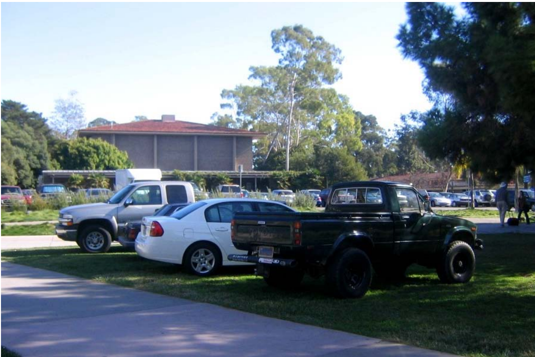
Several cars parked on the lawn near the northeast corner of the UCen, around 1:00 PM on November 22, 2005.