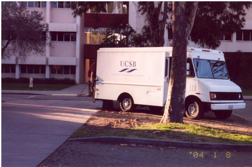
UCSB van parked on dirt, between two trees, after driving on the walkway to the west of Kerr Hall (2004/01/08).