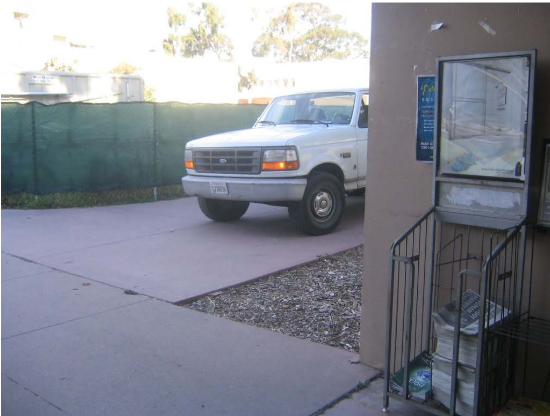
Early morning on April 1, 2005, looking northwest from the Engineering I Building. The truck is used to distribute Daily Nexus and appears in the following photo as well (real photo, not an April fool).