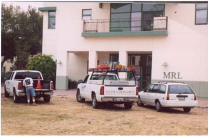
Vehicles parked on the grass (or what is left of it) to the west of the MRL building on 2003/07/21.