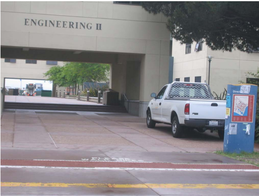
Truck parked on the walkway to the west of Engineering II Building in the early morning of May 5, 2005, around 20 meters from a parking area for service vehicles. All spaces in the parking area were available at the time this photo was taken.