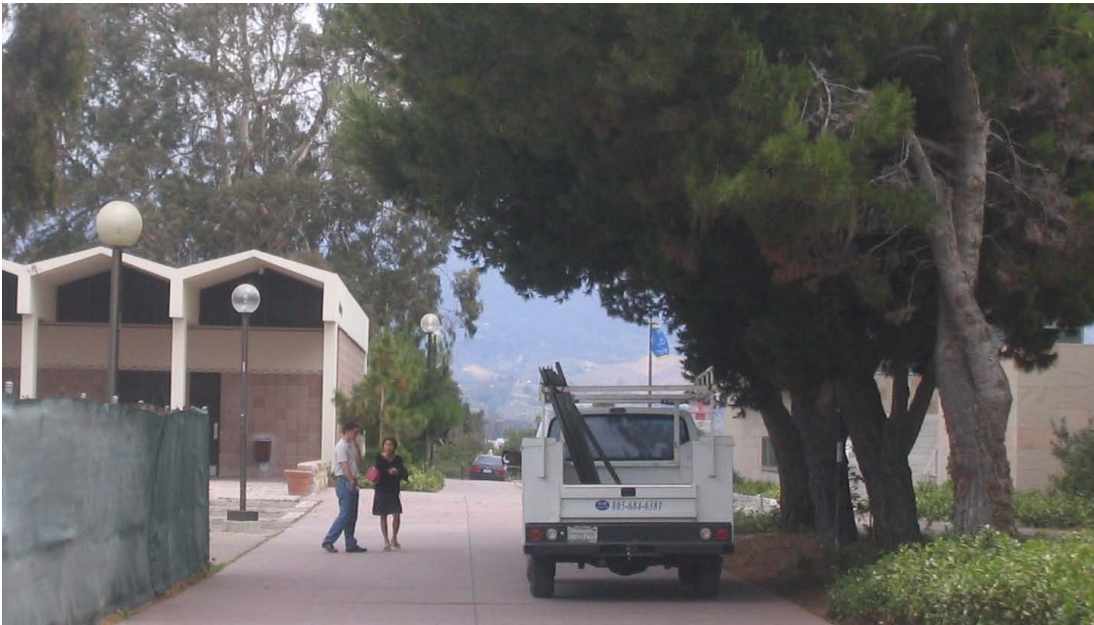
Truck driving on the walkway to the west of the Engineering II Building around noon on June 16, 2005.