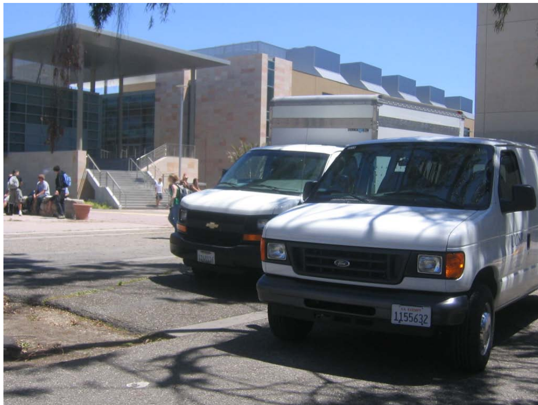
Vehicles parked near the Engineering Science Building, around noon on May 11, 2005.