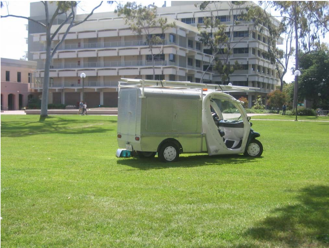
At noon on April 4, 2005, looking south toward Broida Hall. Driving on lawns may be justifiable in emergencies or for some grounds work, but the driver of this particular vehicle drove on the walkway to the south of the Physical Sciences North Building, entered the lawn, and stopped; he then got out and sat down next to the vehicle to have lunch.