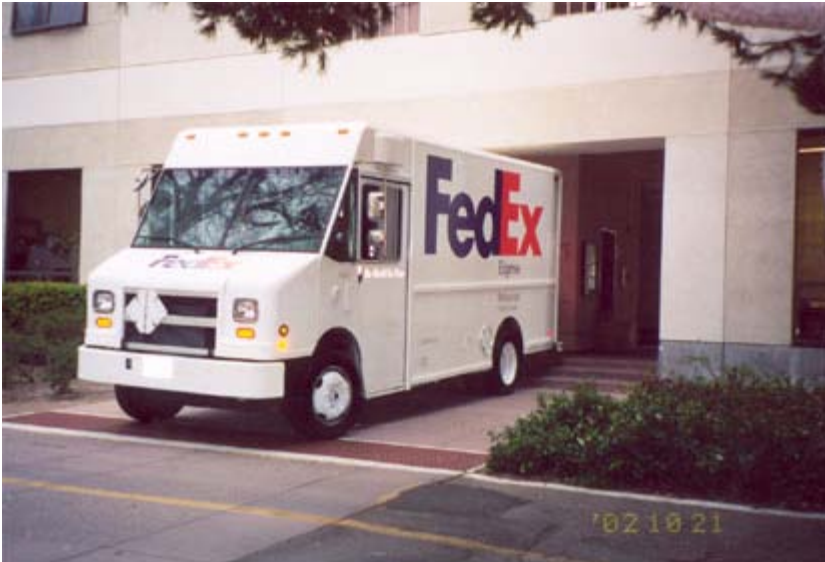
2002/10/21: FedEx truck using the south pedestrian entryway of Engineering II as a loading dock. Just before this photo was snapped, a pedestrian leaving Engineering II almost collided with a fast-moving bike because the truck was completely blocking her view of the bike path.