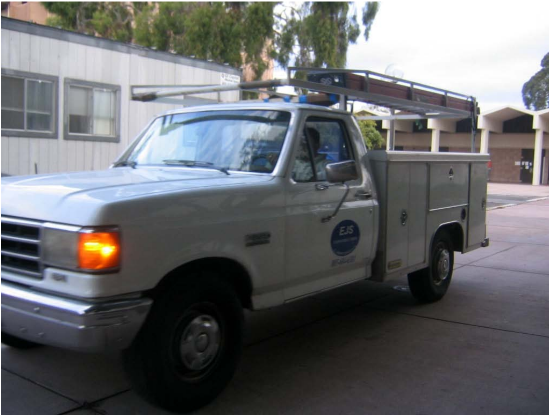
Immediately after the previous photo was snapped, a third vehicle passed in front of the two parked ones, after making a left turn from the walkway to the south of the Chemistry Building.