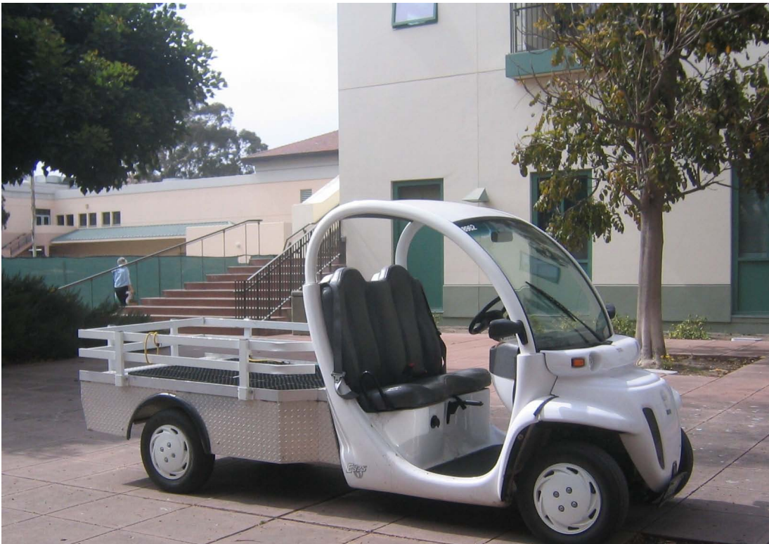
Vehicle parked to the west of the Engineering I building, adjacent to MRL (late PM on June 15, 2005).