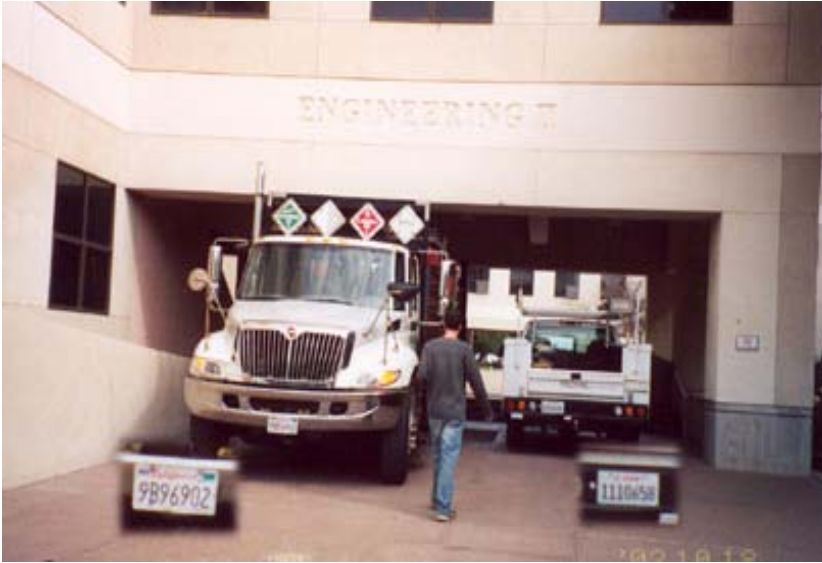
2002/10/18, early afternoon: Trucks using the west pedestrian entryway of Engineering II as a loading dock and, in the process, blocking it almost completely.