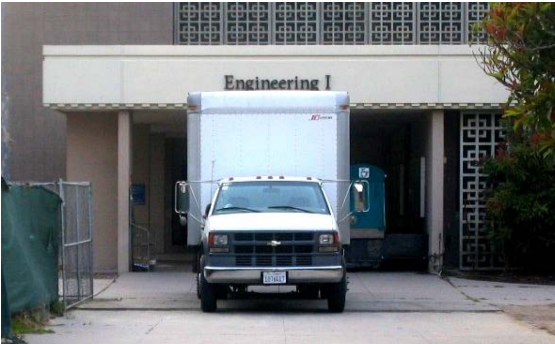
Truck on the walkway to the west of Engineering I, early AM on July 8, 2005.