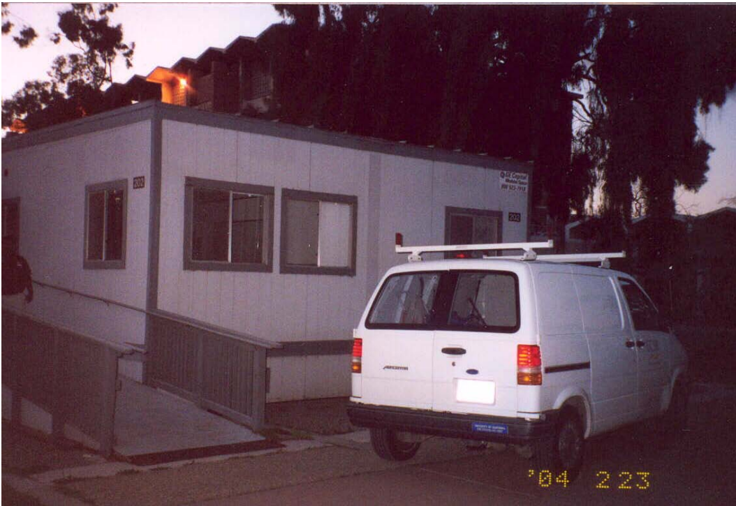
Van parked on the walkway to the west of Engineering II, next to the "Physics Receiving" temporary building (2004/02/23).