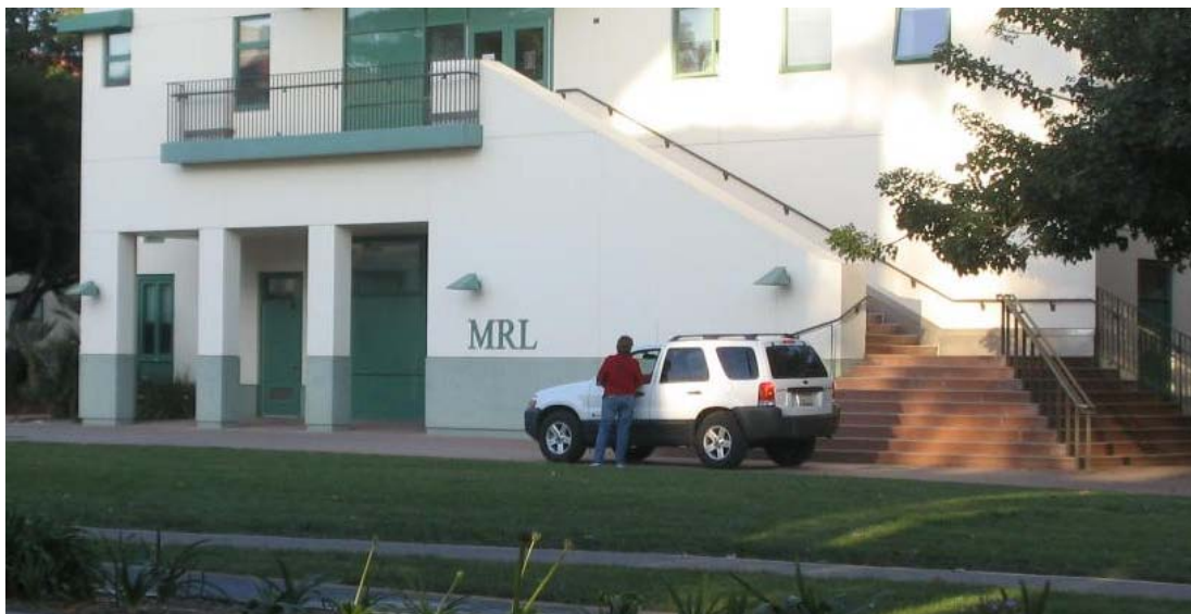
Driver of vehicle parked at the west end of Harold Frank Hall (Engineering 1) around 6:15 PM on 2008/03/05 stops to chat, before leaving the walkway.