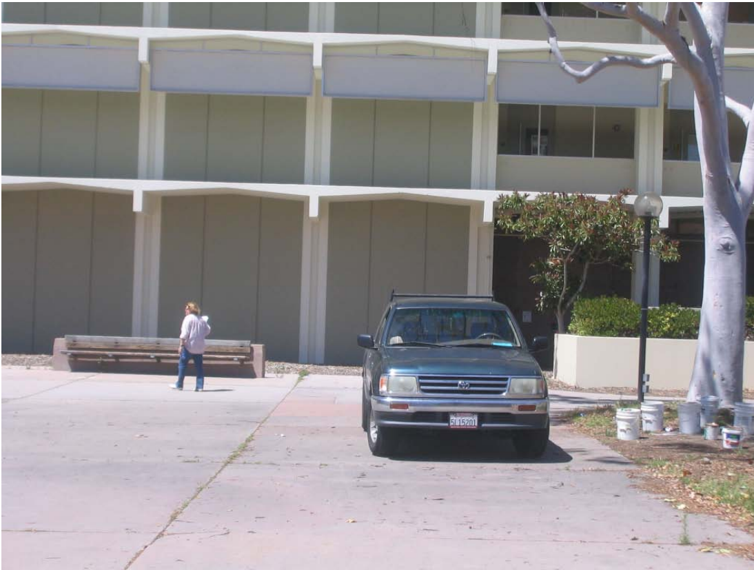
Truck parked to the south of Broida Hall, in the afternoon of May 12, 2005.