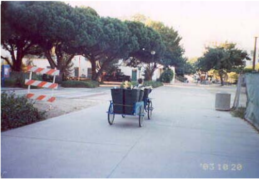
Recycling 5-wheeler on its leisurely trip along the walkway to the west of Engineering II on 2003/10/20. This is perhaps the most violated walkway on campus, with trucks, vans, and bikes moving there at all times.