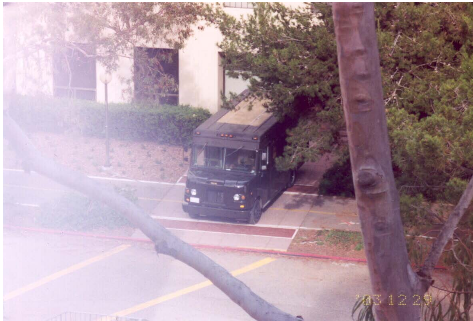
Let's end the photos for this year with the same UPS van that began the sequence of photos for 2003, shown here in exactly the same south walkway of Engineering II (2003/12/29).