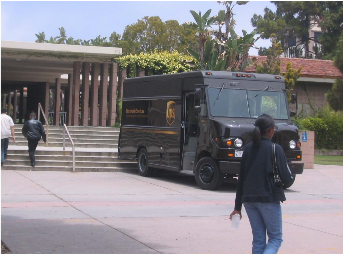
UPS van parked to the south of the Music Building, near UCen in the early PM on June 14, 2005.