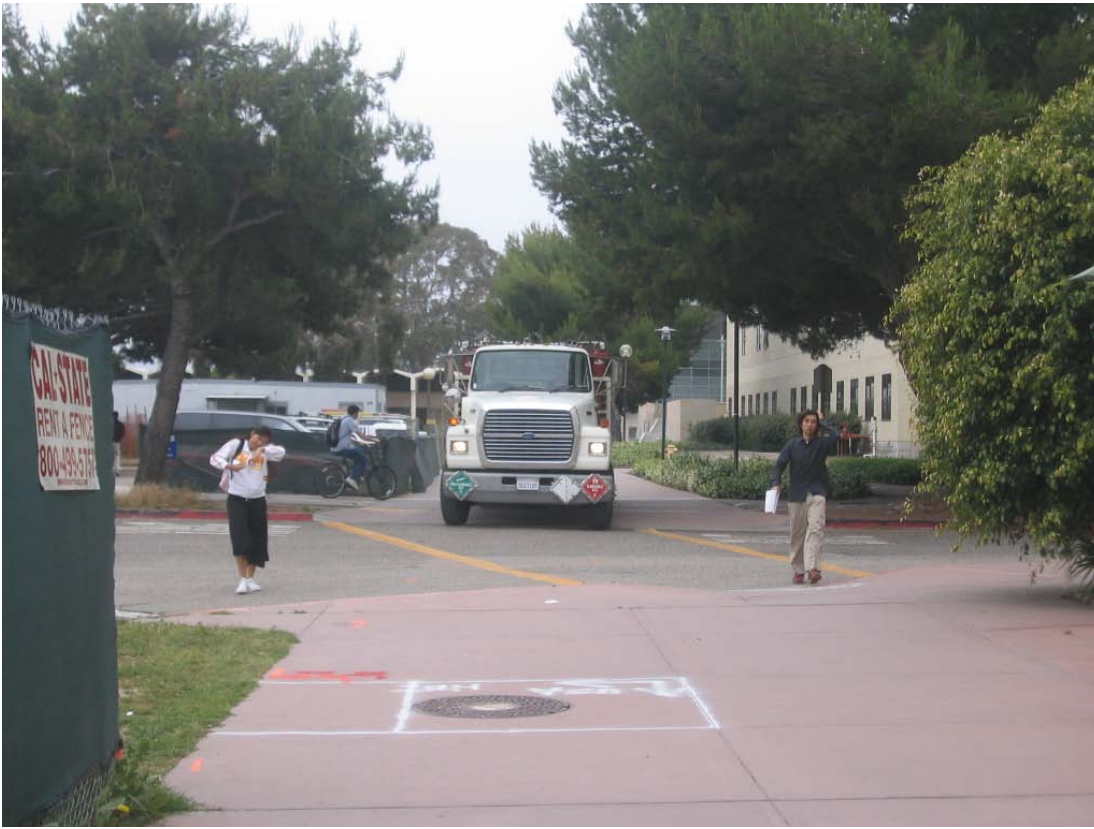
Huge truck leaving the vicinity of Engineering II via the walkway to the west of the building (around 6:30 PM on May 27, 2005). The truck's tire marks on the walkway are shown in the next photo.