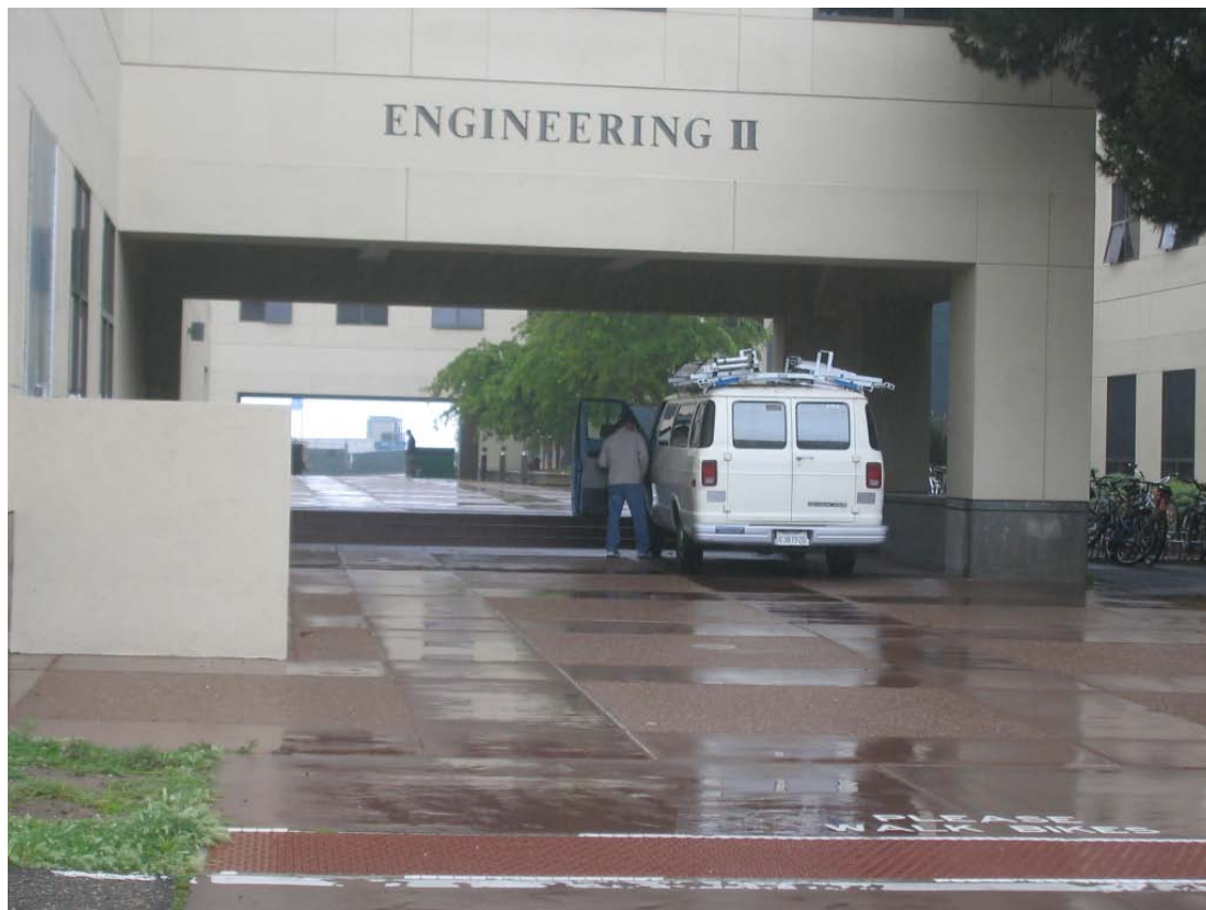
On a rainy day (May 5, 2005), the driver of this van preferred the covered walkway at the west entrance of Engineering II Building to the wide open service parking area that is about 30 meters away.