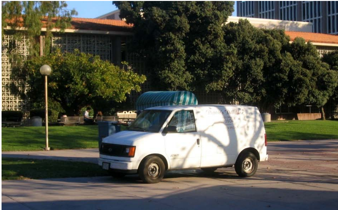
Van parked on the walkway between the Arbor and Davidson Library on November 18, 2005, around 4:00 PM.