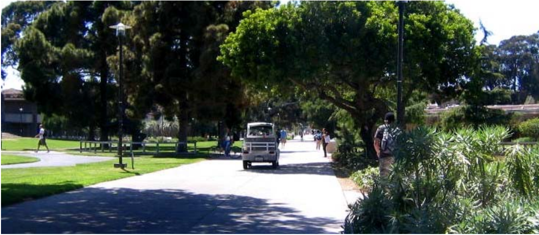
Vehicle moving westward on the walkway located to the south of South Hall, around 3:00 PM on July 11, 2007.