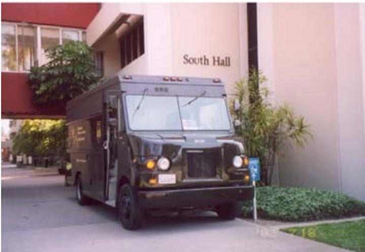
UPS van on the walkway to the north of South Hall on 2003/07/18, a few feet from the roadway.