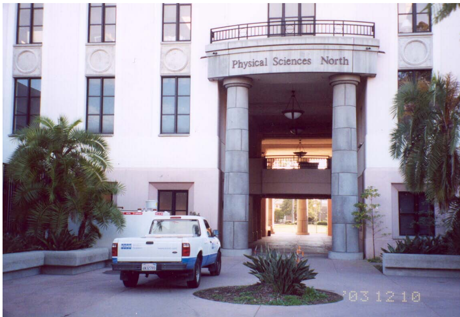
The north side of Physical Sciences North, on 2003/12/10.