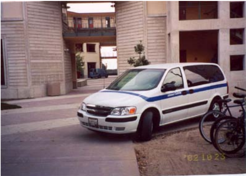
2002/10/23: Van parked to the north of Bren Building.