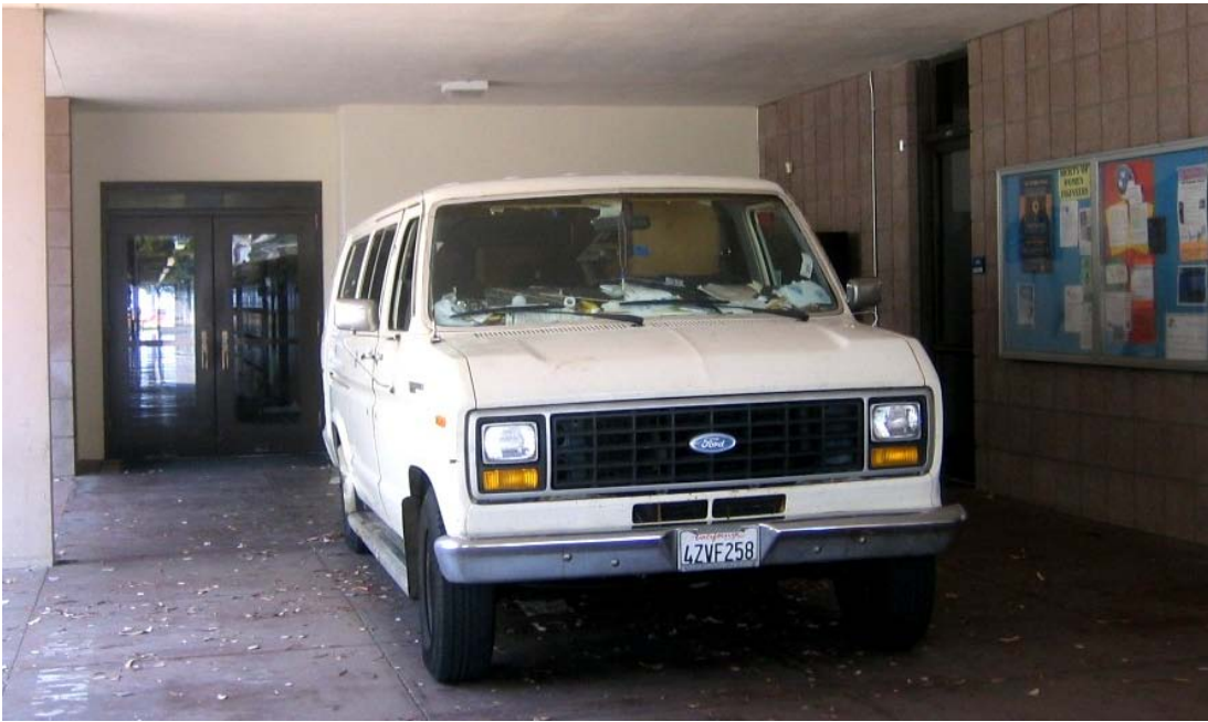
An unmarked van parked in the covered walkway near the west entrance of Harold Frank Hall (Engineering I) on 7/25/2006.