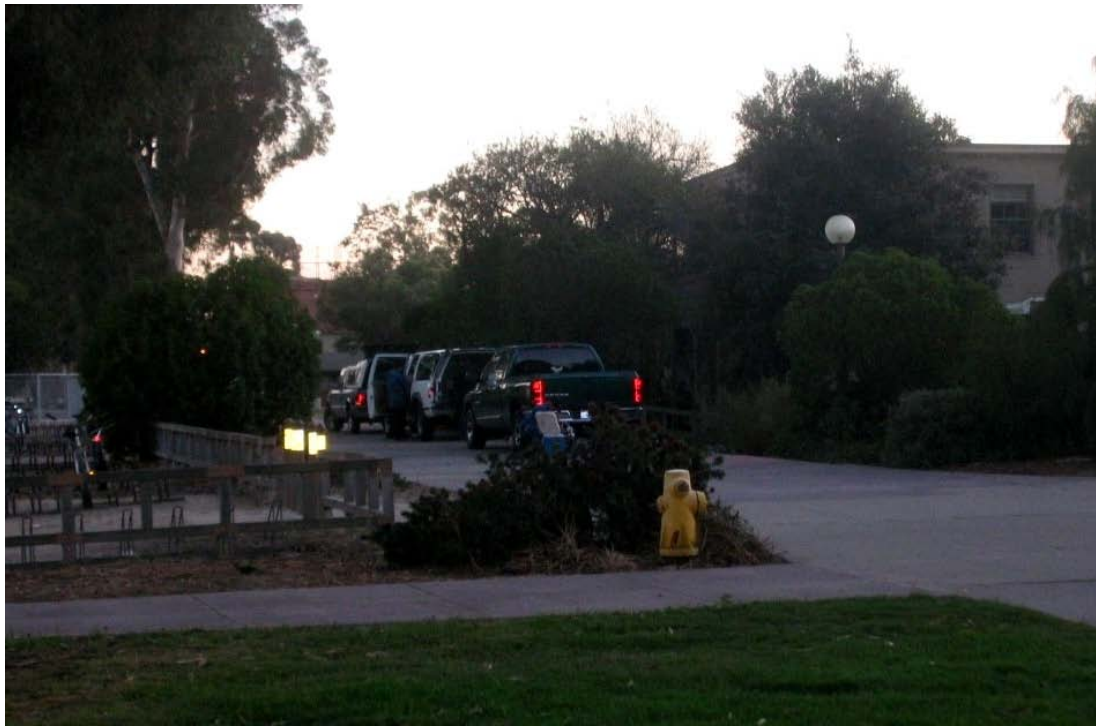
The walkway, to the east of Building 406, between Broida Hall and Davidson Library, looks busier than a street in this photo taken in the early evening on October 10, 2005.