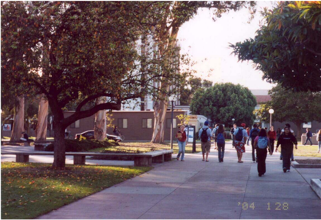
Auto on walkway to the west of Webb Hall, as it approaches the busy walkway connecting Engineering I to the Davidson Library (2004/01/28).