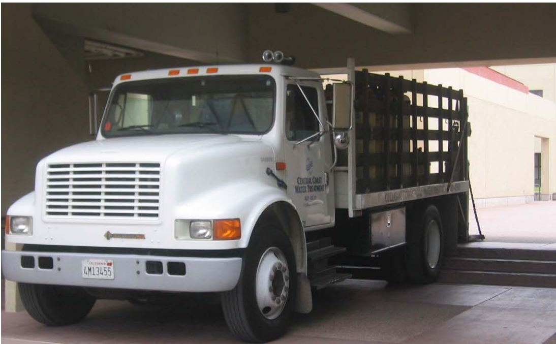
Large truck parked to the west of the Engineering II Building around noon on June 14, 2005 (please see the next photo).