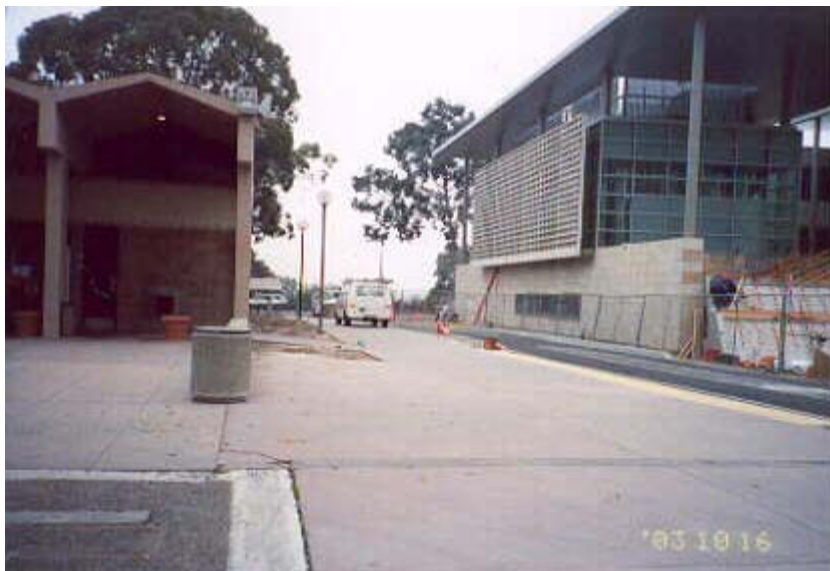
Van driving on the walkway between Chemistry and new Engineering Sciences Buildings on 2003/10/16.