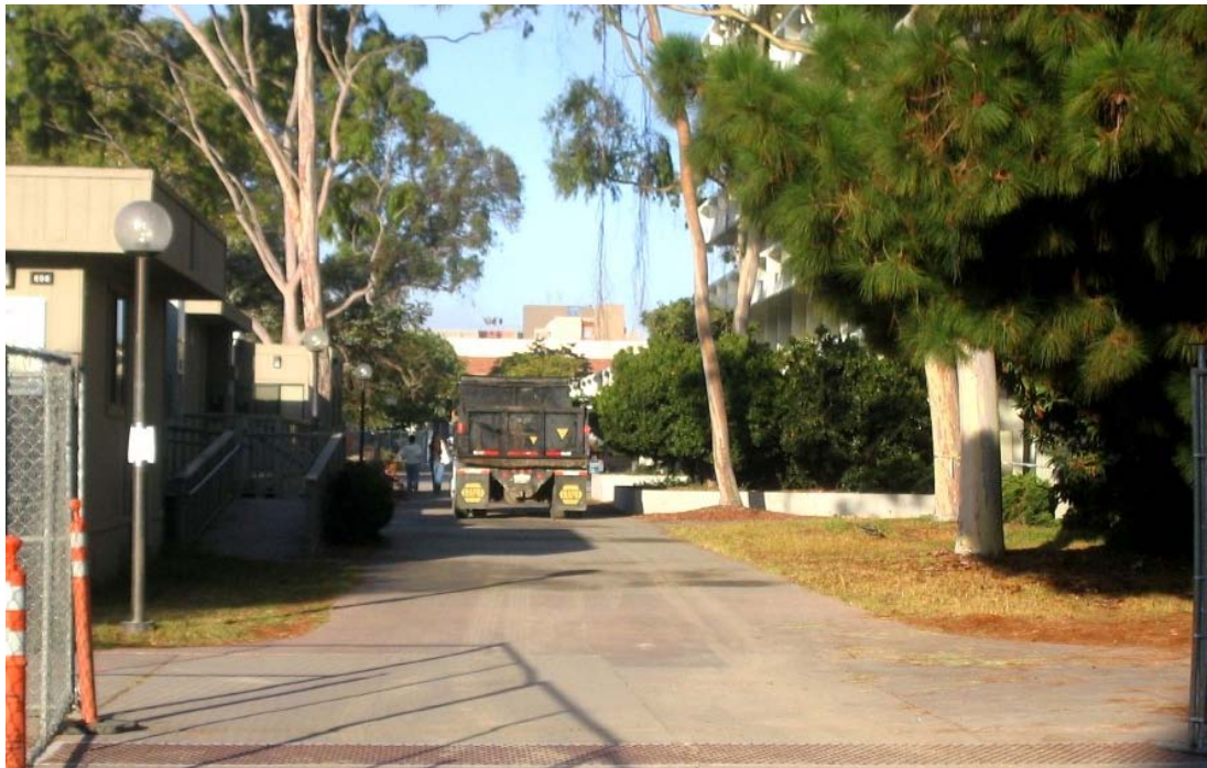
Heavy truck on the walkway to the west of Engineering I, around 8:25 AM on October 11, 2005.