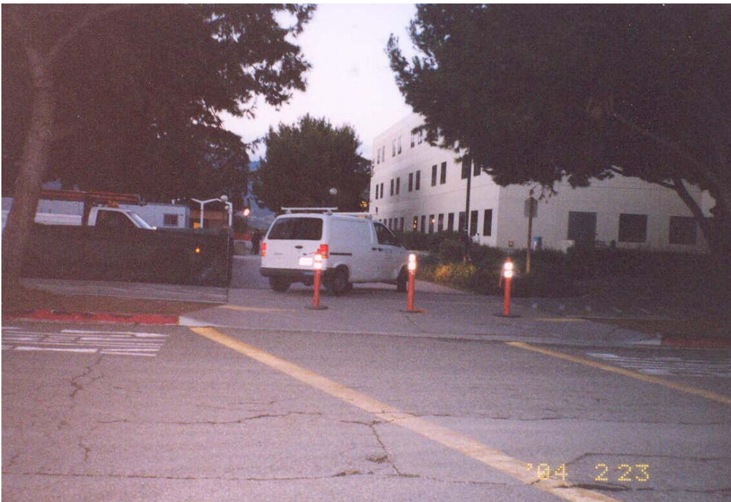
Van using a bicycle path to get around pylons, presumably placed to discourage autos from driving on the walkway to the west of Engineering II (2004/02/23). It appears that Transportation and Parking Services has given up on using these pylons (they are no longer there), given that they were routinely moved aside by drivers who wanted to use the walkway.