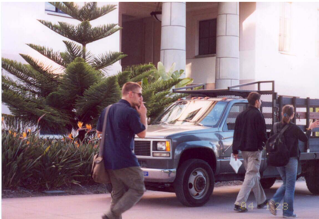
Truck parked to the south of Physical Sciences North building (2004/01/28).