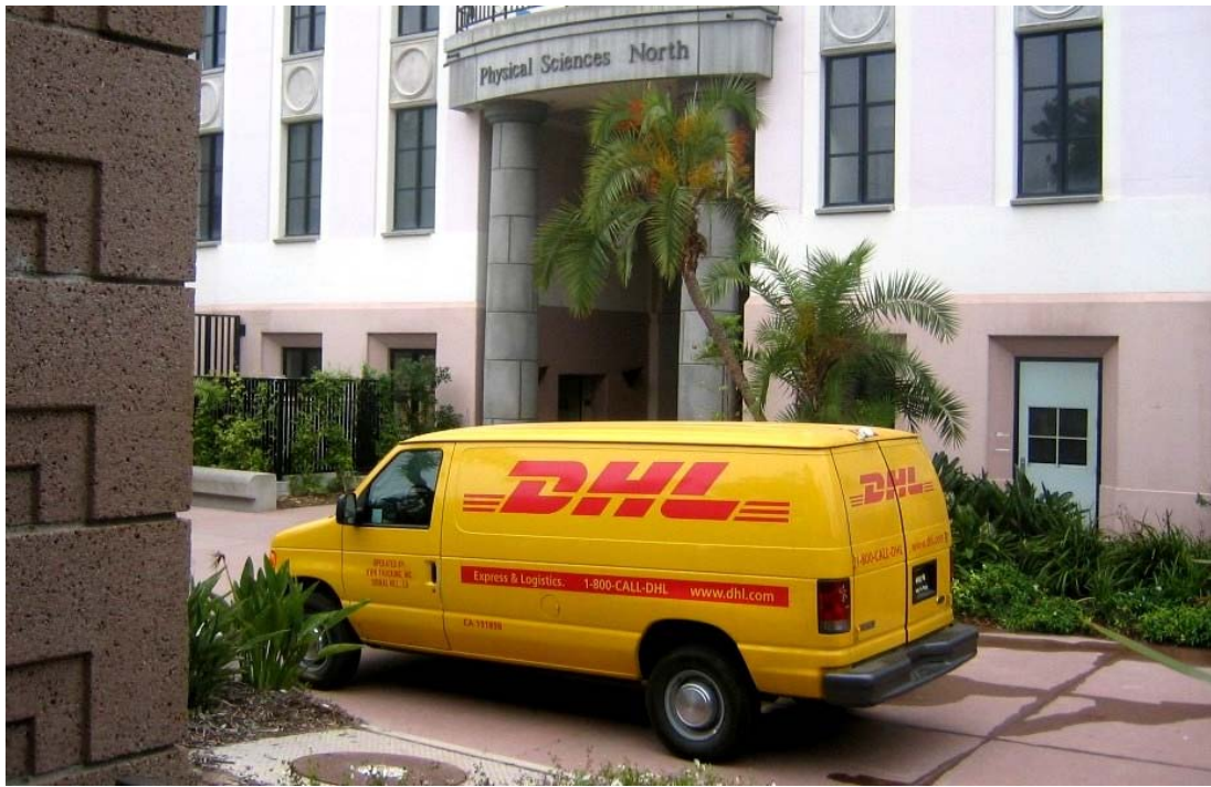
DHL delivery van to the north of Physical Sciences north, mid morning on July 26, 2005.