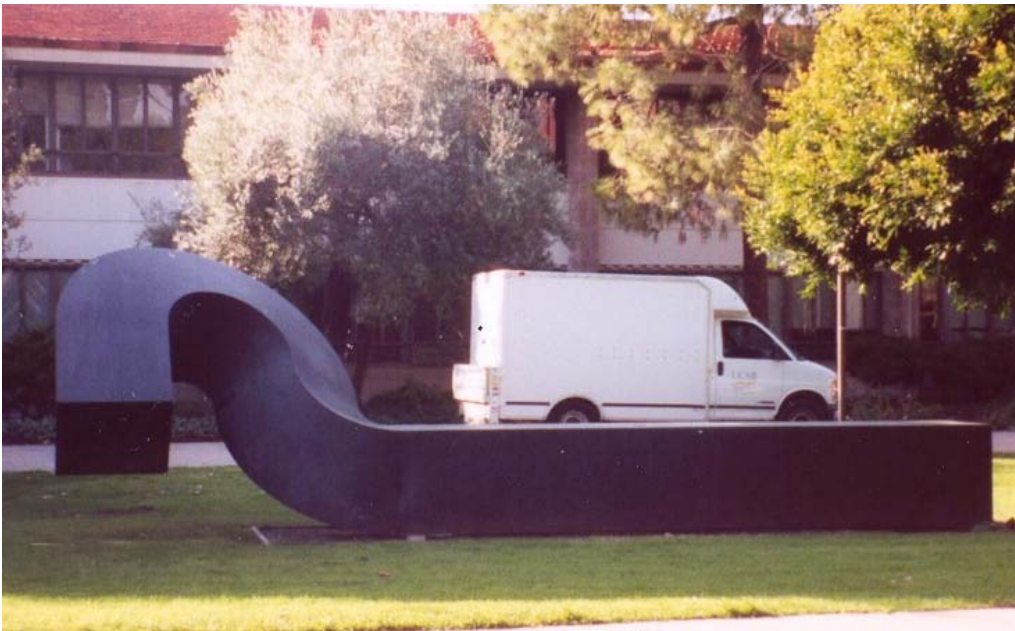
Even this serene core area of our campus, to the east of North Hall, between the Arbor and Cheadle Hall, is not immune from vans, trucks, and other vehicles (2004/01/16).