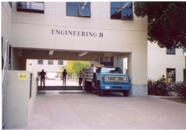
Another example of a walkway and steps misused as a loading dock (2003/07/18).