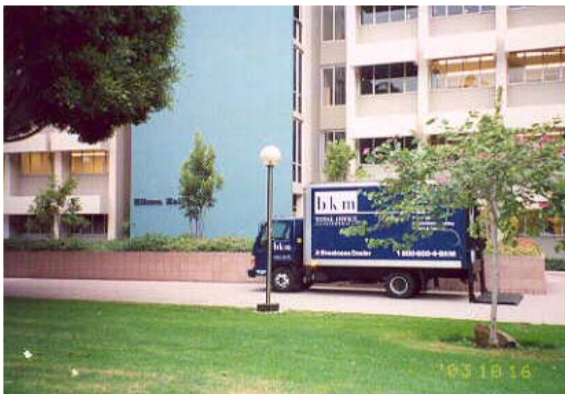
Truck parked on the walkway to the south of Ellison Hall on 2003/10/16. Doesn't Ellison Hall have an entrance for deliveries?