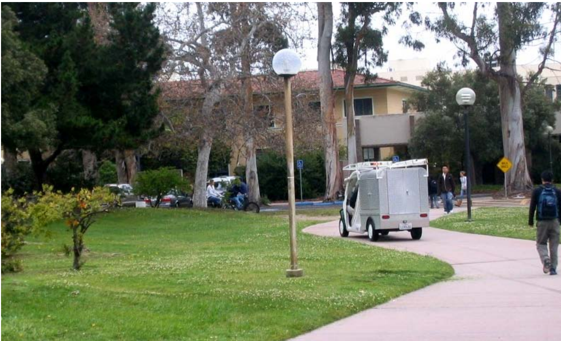
This vehicle had no business that necessitated driving on the walkway to the southeast of Davidson Library, just before noon on 5/3/2006. It went from Parking Lot 3 to the road between Davidson Library and Webb Hall, using the walkway as a shortcut.