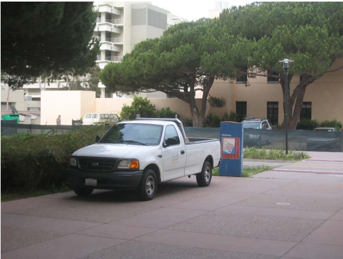
This particular truck usually prefers to park on the walkway to the west of Engineering II Building. It is shown in this photo on May 16, 2005. Clearly visible behind the truck is a service parking area with 8 of the 10 spaces available.