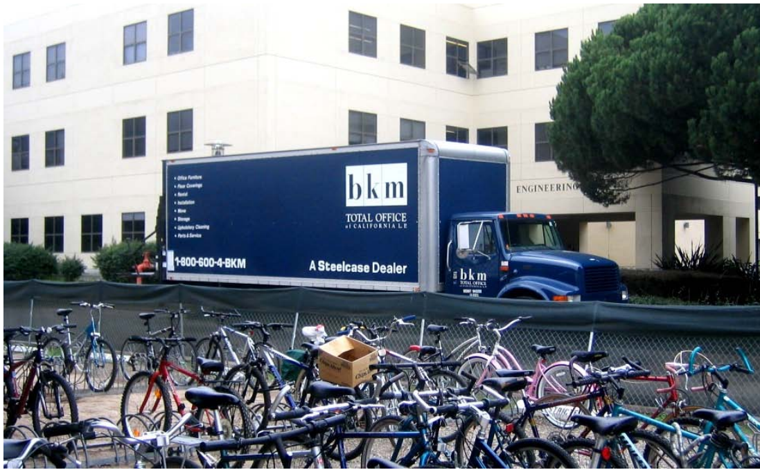
Large truck moving on the walkway to the west of Engineering II on November 8, 2005, around 2:30 PM.