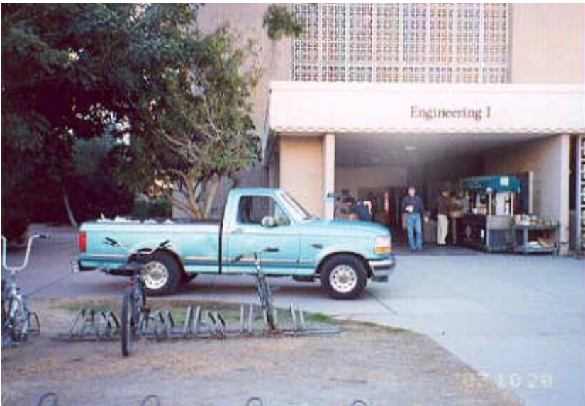
The Daily Nexus distributor stops on the west side of Engineering I on 2003/10/20 . . .