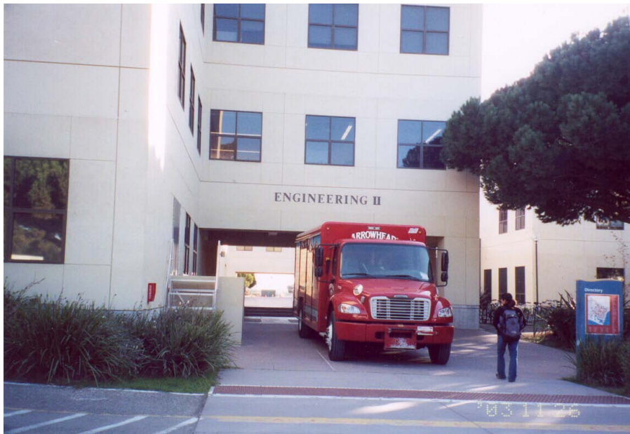
Huge trucks should probably be banned from the narrow roadways of our campus, let alone on walkways. Vendors should be asked to use smaller vehicles for campus deliveries. This photo was taken on 2003/11/26 to the west of Engineering II.