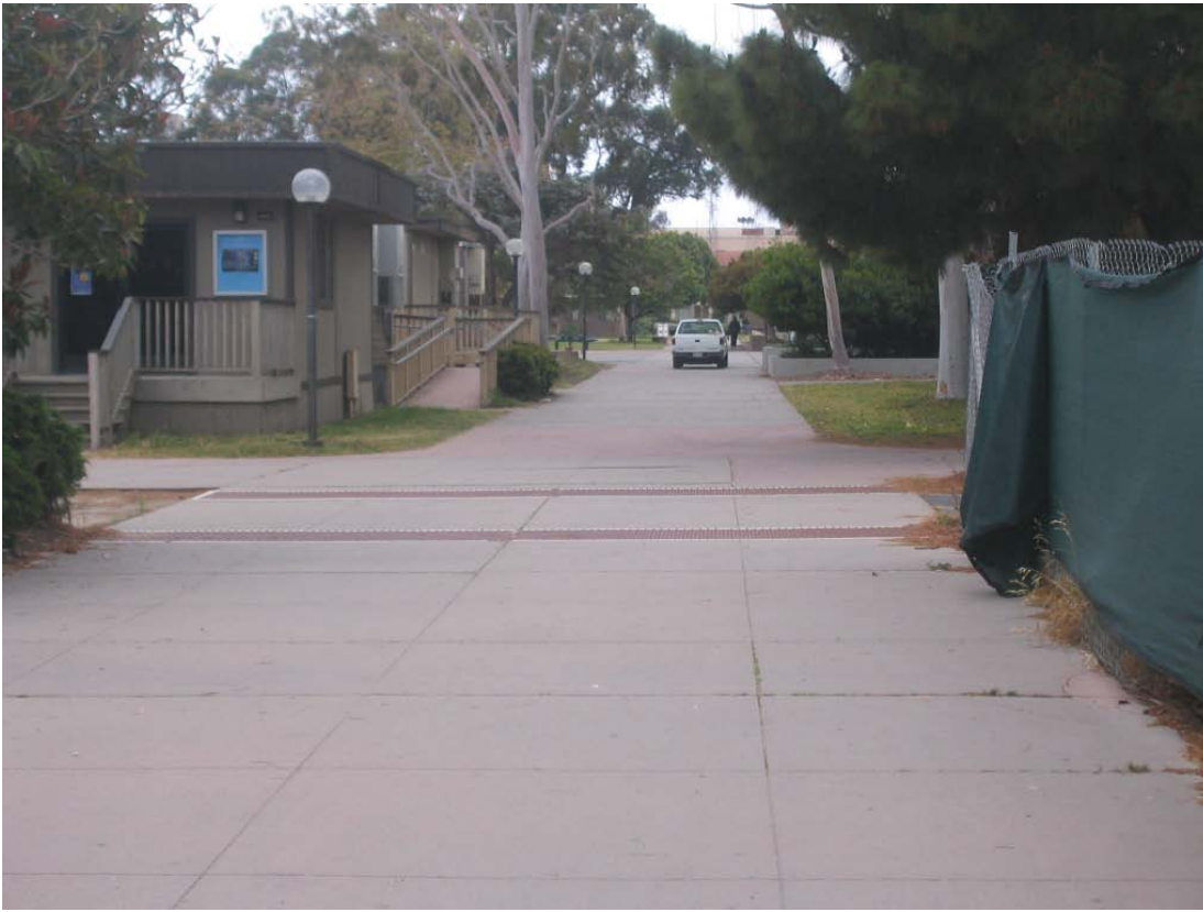
The Daily Nexus distribution truck, caught one more time around 8:15 AM on April 27, 2005, on its grand tour of the campus walkways (shown here to the south of Broida Hall, driving from Engineering I Building toward Davidson Library).