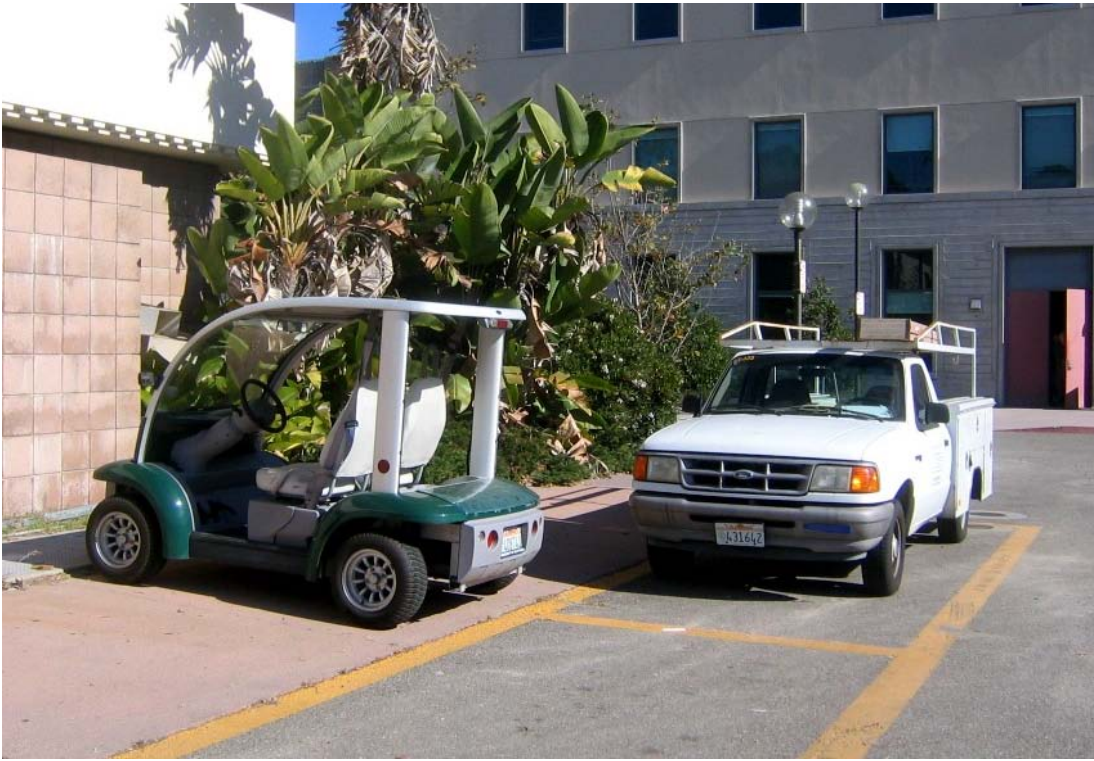
Vehicle parked across the sidewalk to the west of Bren Hall, thereby completely blocking it (November 22, 2005, around 1:00 PM).