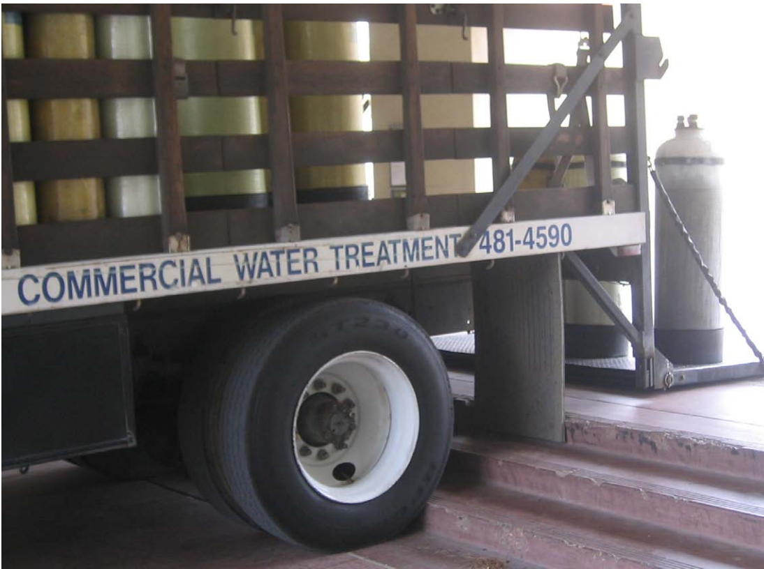
Close-up of damaged steps due to the truck in the previous photo and similar vehicles using this area to the west of the Engineering II building as a loading dock.