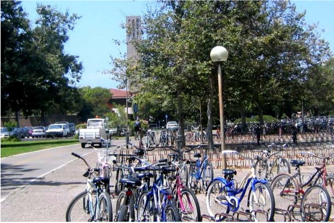
Electric vehicle driving on the bike path to the south of Davidson Library, around 12:30 PM on 8/17/2006.