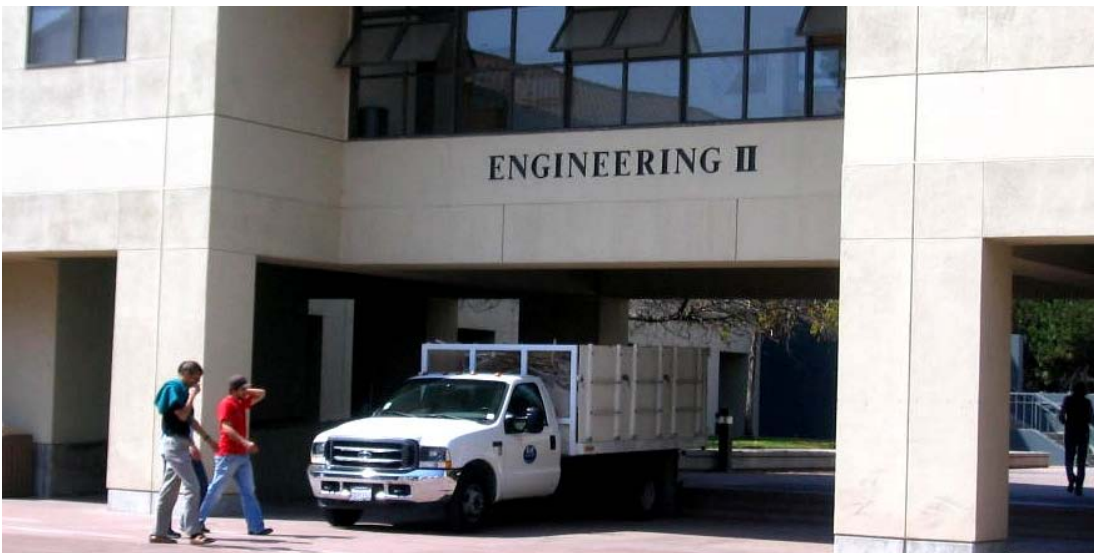
Truck parked on the east end of Engineering II around noon on September 18, 2007.