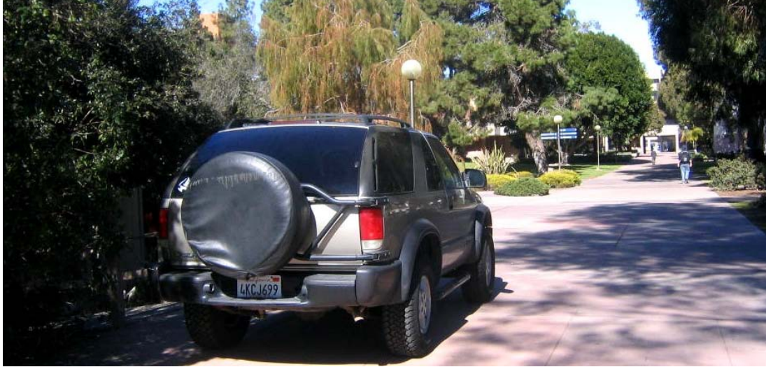
Vehicle parked (1:23 PM on Feb. 8, 2008) on the east walkway near Building 406, located just to the east of the Davidson Library.

The size of this page has grown considerably. So, a sampling of violations will be posted from now on, just to serve as reminders that things have not changed.