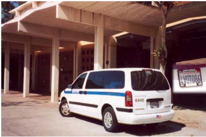
2002/10/18, around noon: Vehicle parked on the south side of Broida.