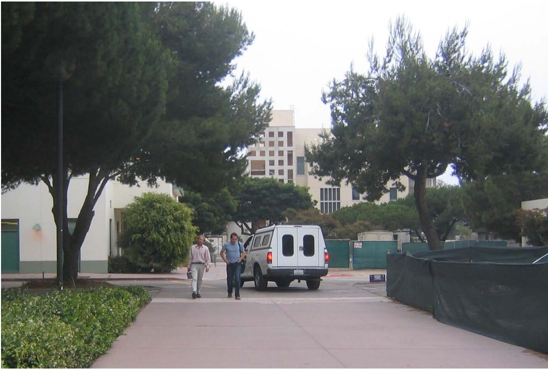
Van driving on the walkway to the west of the Engineering II building (late PM on June 14, 2005).