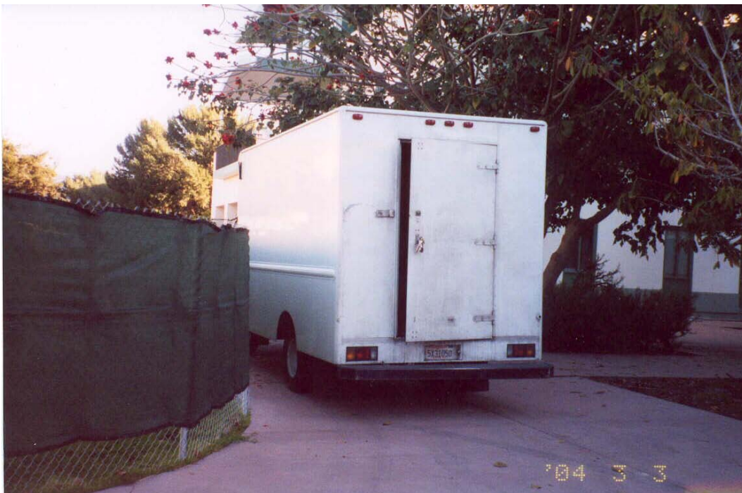
Large, unmarked delivery van almost completely blocking the walkway, already narrowed by construction fencing, to the west of Engineering I and MRL (2004/03/03).