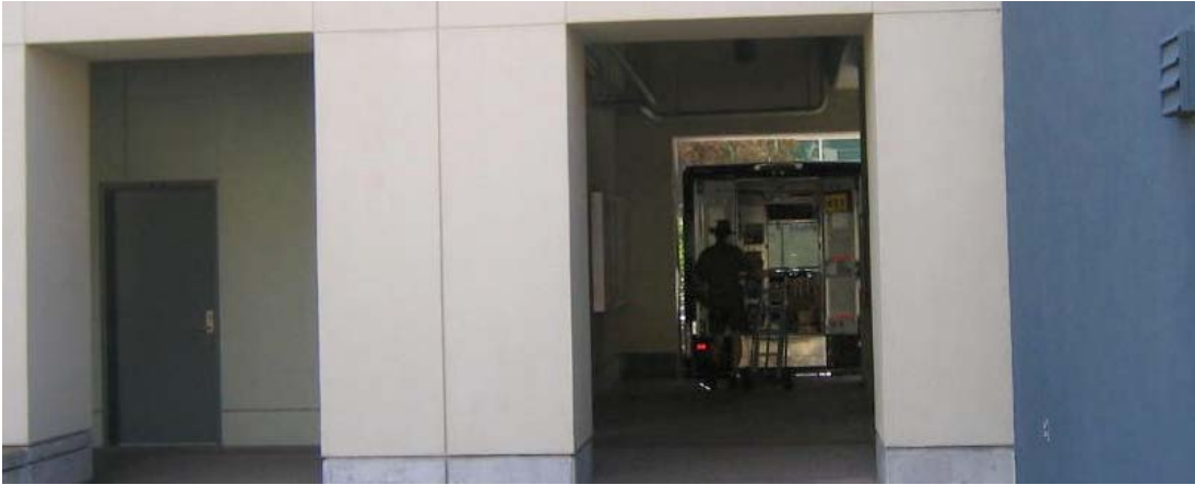
UPS vehicle parked on the walkway to the south of Engineering 2, blocking the walkway while using it as a loading dock, around 1:00 PM on 2008/03/06.