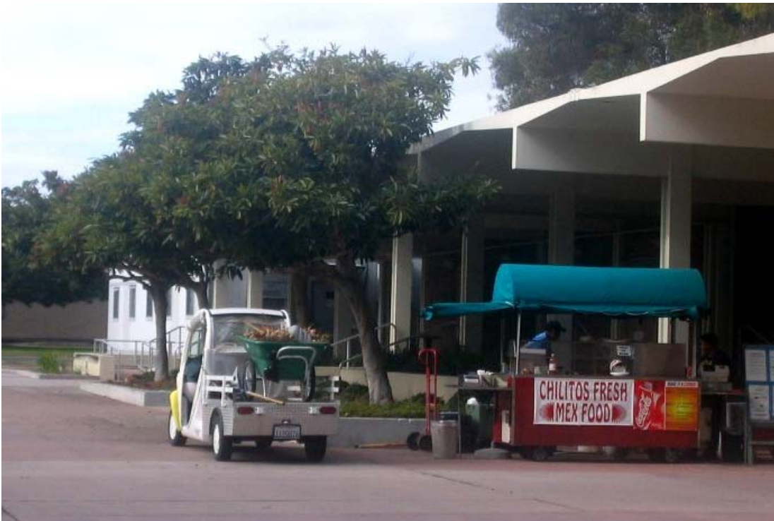
On January 4, 2007, shortly before 1:00 PM, this vehicle drove from the parking lot behind the Bren School Building onto the walkway to the south of Broida Hall, apparently only to stop for lunch at the Chilitos cart.

Only a few photos are posted to show that the problem of vehicles on campus walkways has not been resolved. The smaller number of photos compared with previous years does not mean that we have less of a problem this year.