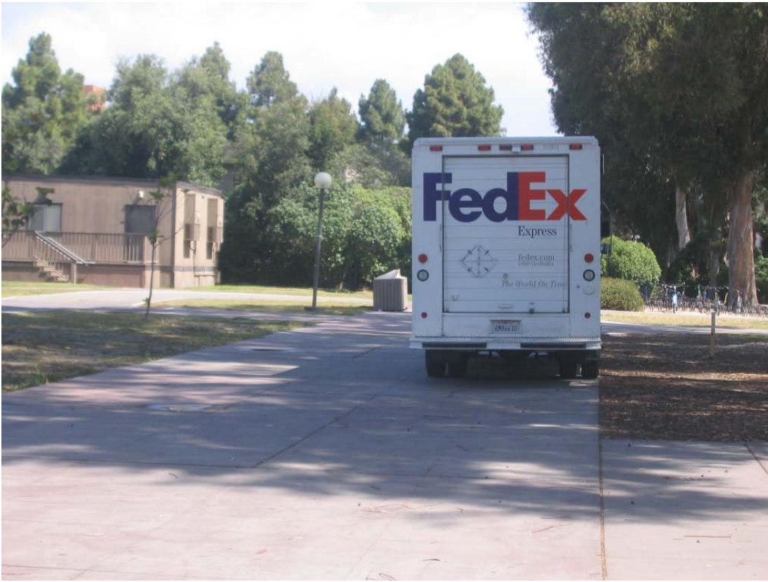
FedEx vehicle parked on the walkway to the east of Webb Hall around 10:30 AM on June 9, 2005.