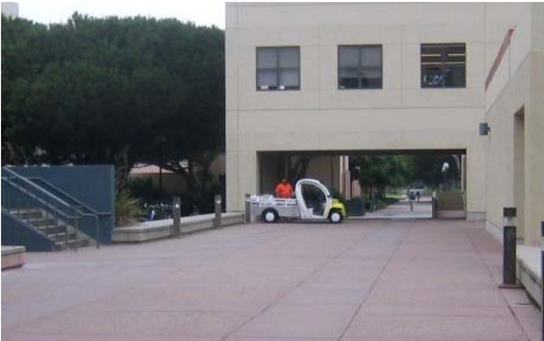
Drivers of electric vehicles seem to believe that they can drive anywhere on campus. This one drove onto, and parked in, the Engineering 2 courtyard, around 8:00 AM on 8/4/2006.