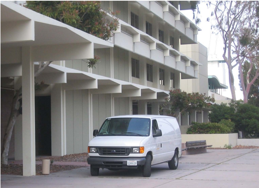
Van parked to the south of Broida Hall around 6:00 PM on June 13, 2005.