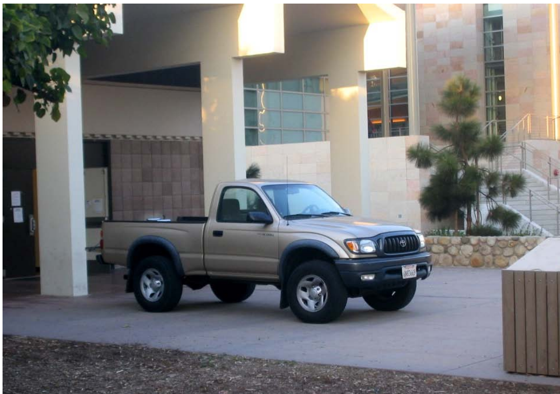
Unmarked truck parked at the southeast corner of the Chemistry Building, next to Chem 1179 classroom, around 6:00 PM on October 12, 2005.