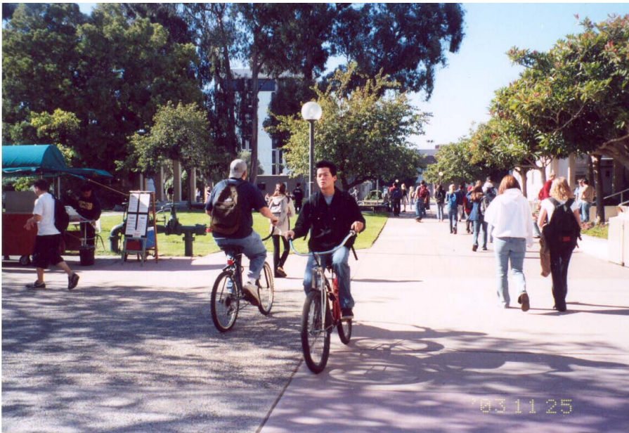
Bicycles also abuse campus walkways on a daily basis; here, two bike riders negotiate a busy walkway to the south of Broida on 2003/11/25.