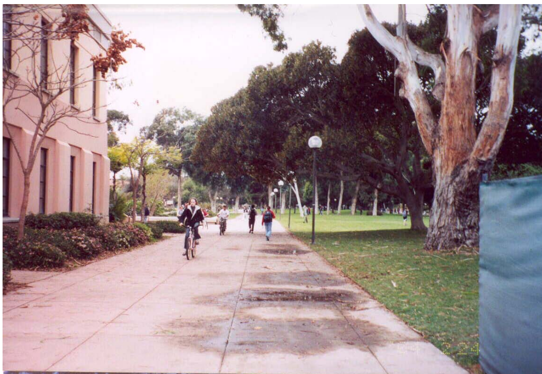
Unofficial bike path to the north of the Physical Sciences South building (2004/02/24); sometimes, there are more bikes than pedestrians on this walkway.