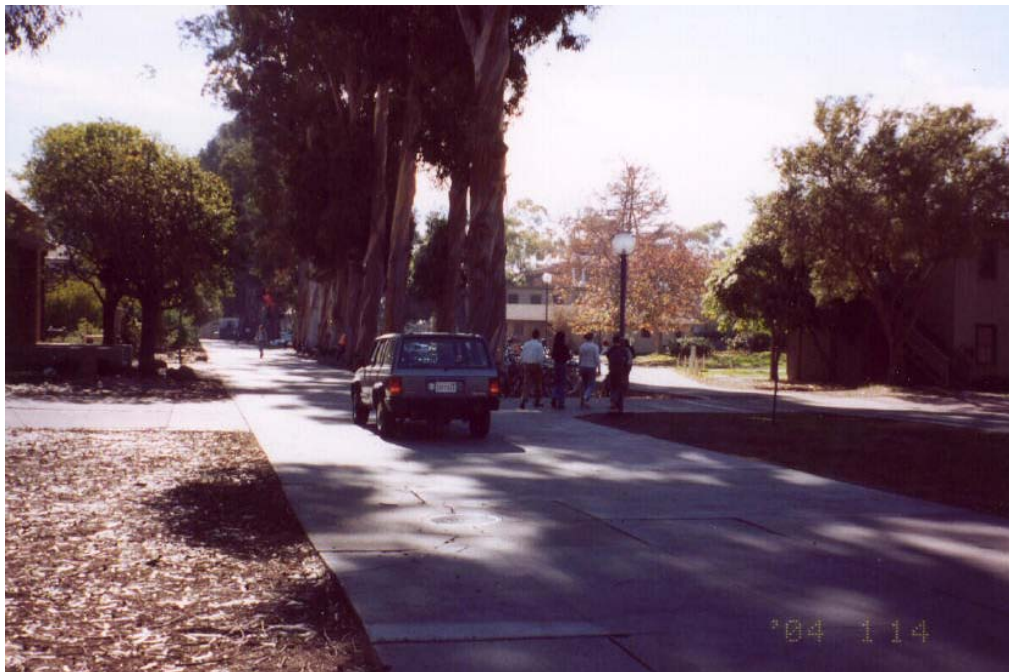
Here is an SUV (apparently not a vendor or maintenance vehicle) driving merrily on the walkway to the west of Webb Hall on 2004/01/14