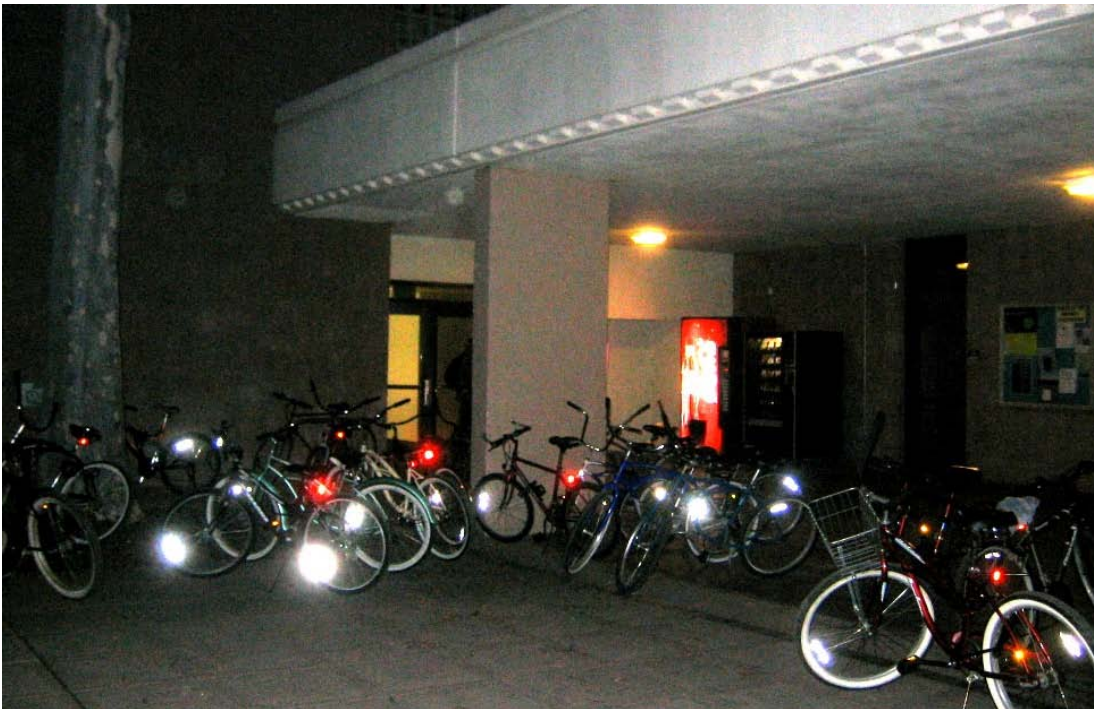
Bicycles parked near the west entrance of Engineering I on November 2, 2005, around 7:00 PM.