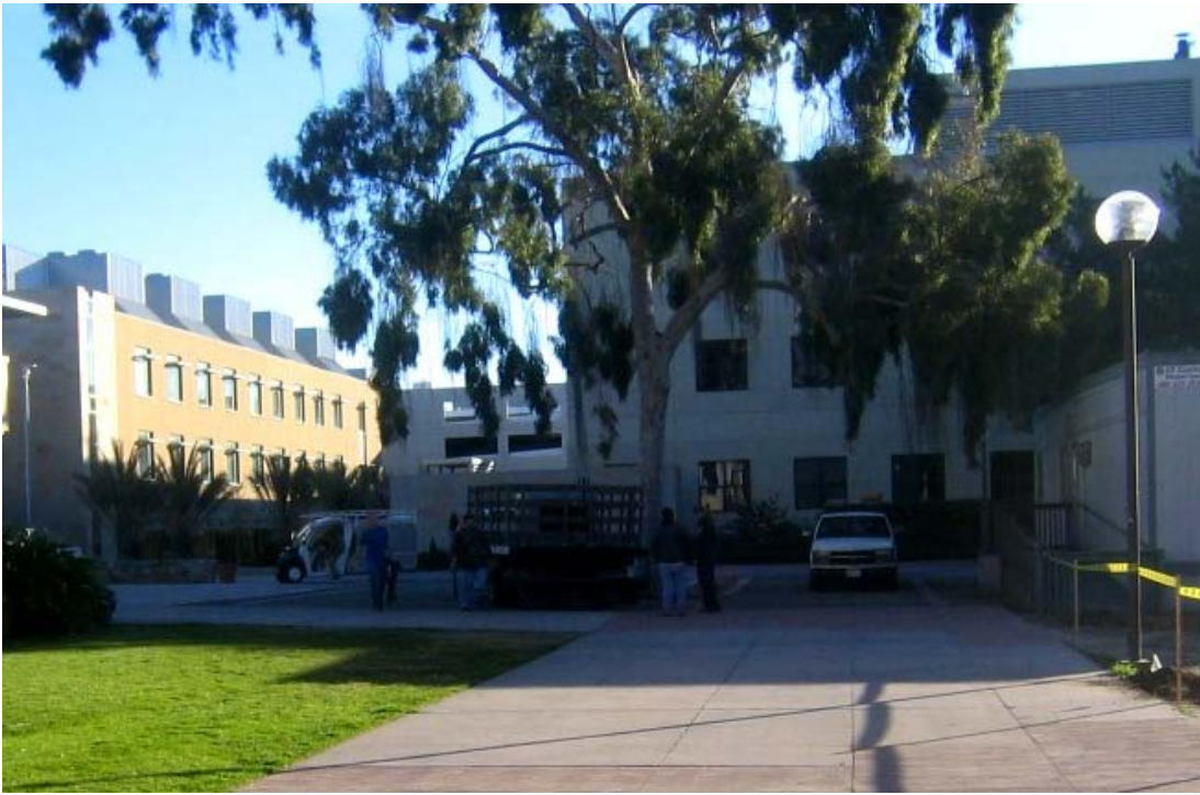
In this photo, taken shortly after 9 AM on 2005/12/7, the walkway to the west of ESB and Engineering II, looks more like a busy street.