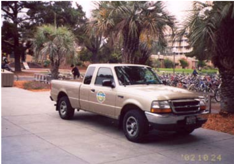
2002/10/24, around 8:30 AM: Truck parked on the north side of the Arts Building (the corner adjacent to the bike path and Storke Tower).