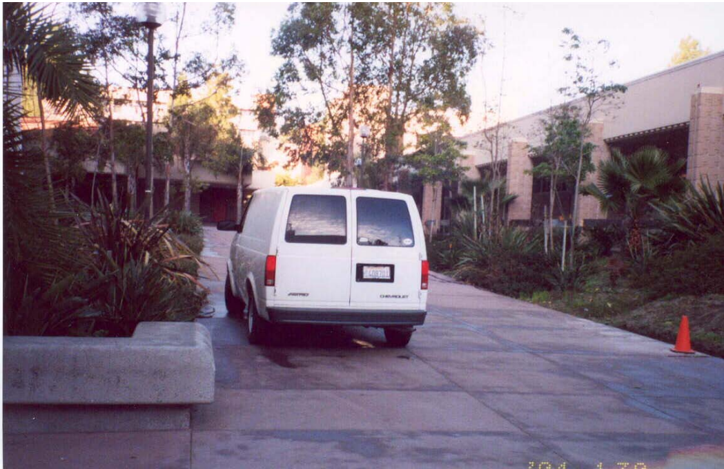
Van parked on the walkway between Physical Sciences North and Phelps Hall (2004/01/30).