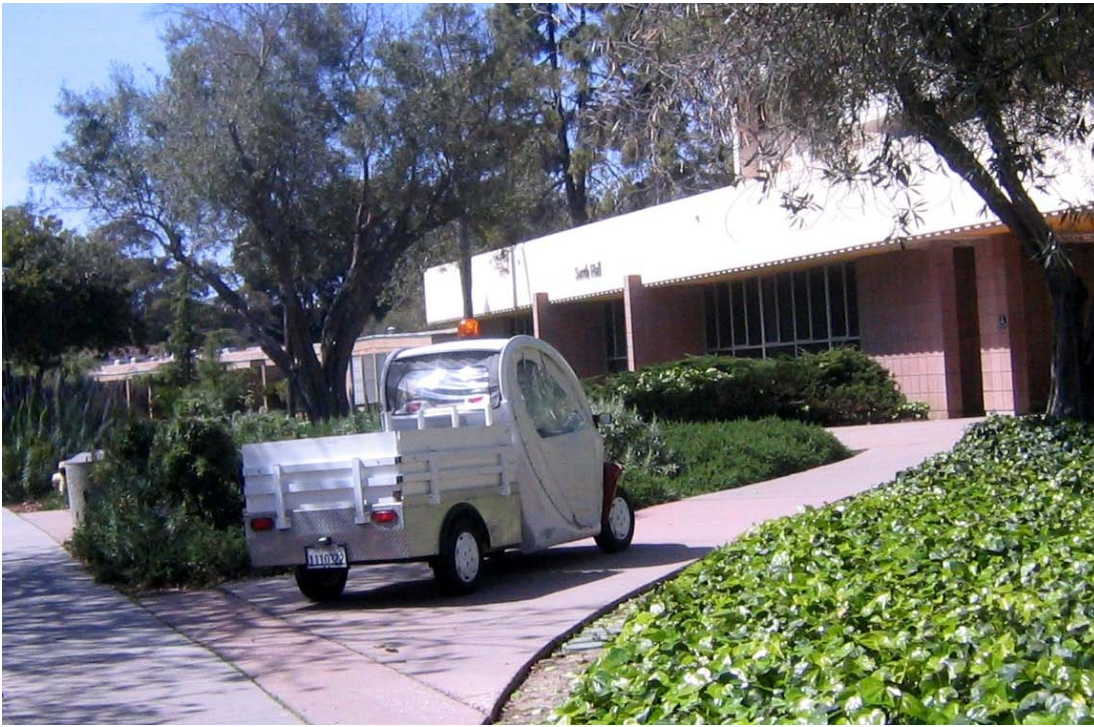
This University vehicle drove through the walkway between Girvetz and South Halls on March 22, 2006, without stopping. It essentially used the walkway as a shortcut for getting from Parking Lot 3 (south of Davidson Library) to the service road located between South and Kerr Halls.