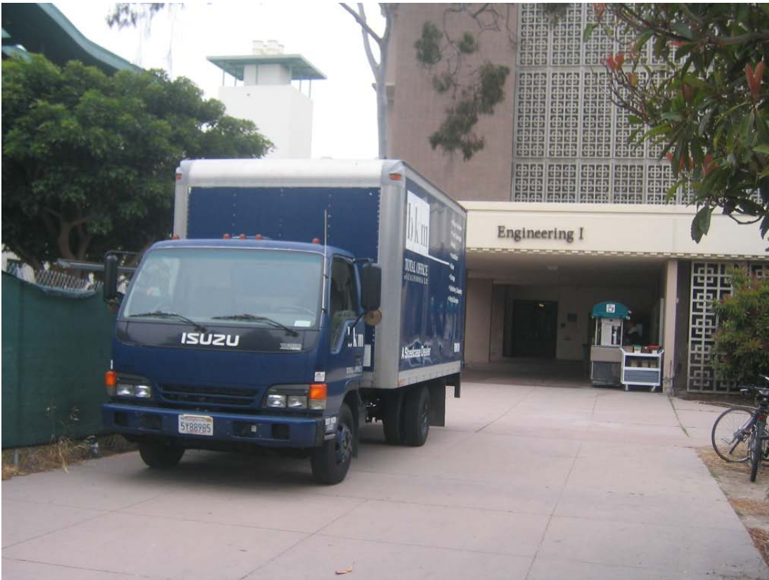
Large delivery truck parked to the west of Engineering I building, early AM on May 4, 2005.