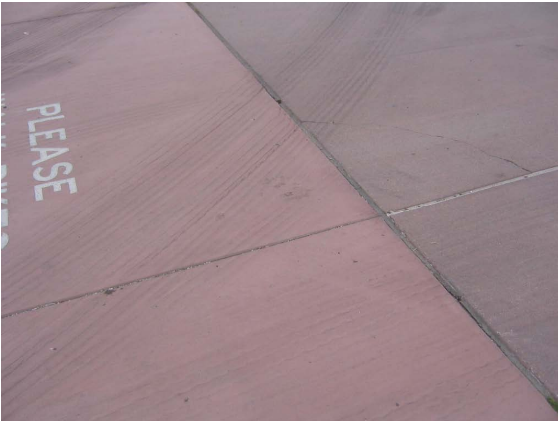
Tire marks left by the huge truck shown in the previous photo may help to explain the uneven and damaged surfaces of many campus walkways (May 27, 2005).