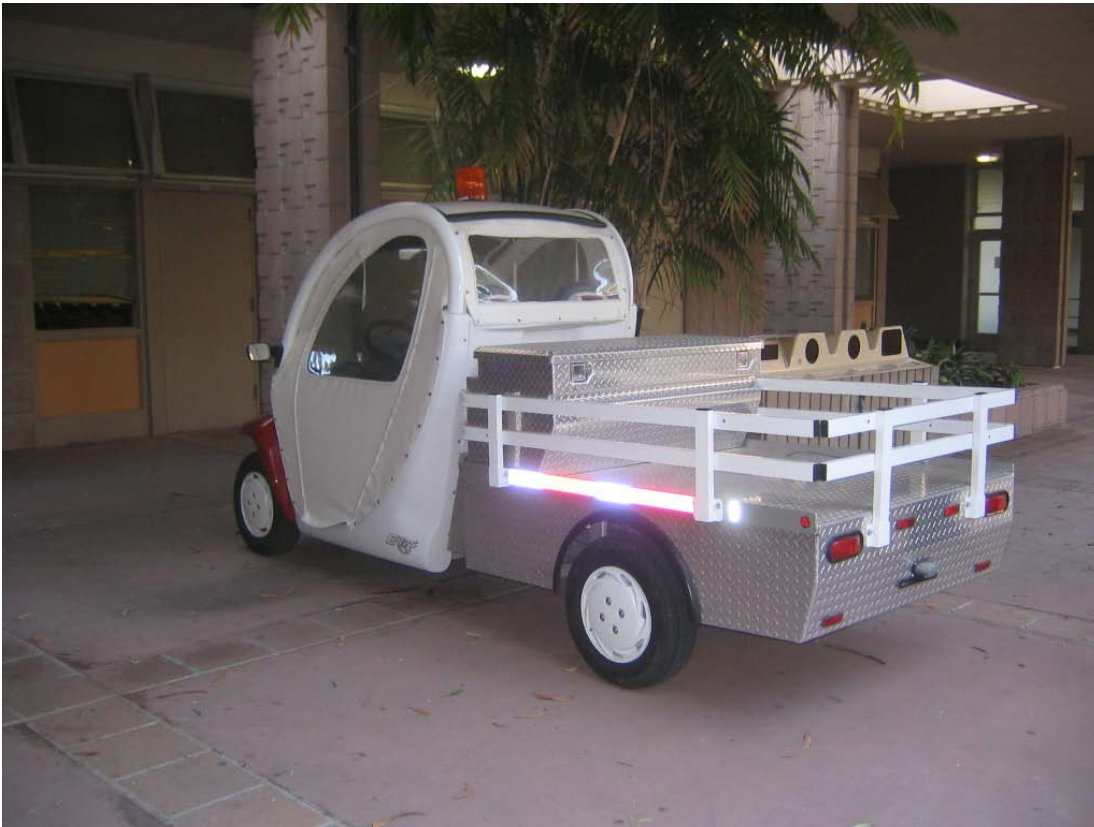
Vehicle parked in the northwest corner of Phelps courtyard, around 7:00 PM on May 17, 2005.