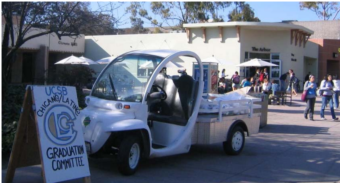
Vehicle moving on the walkway between temporary buildings to the east of Davidson Library, and then parked near the Arbor, around 4:30 PM on 2008/03/05.