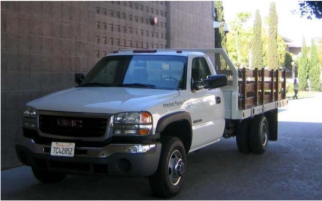
Truck parked on the covered walkway to the south of the arts building, near the UCen, around 5:30 PM on July 6, 2007.