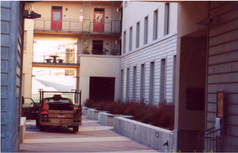
Bren Hall courtyard on 2004/01/14. This area is literally inside the building and is not intended for vehicles, except in emergencies.