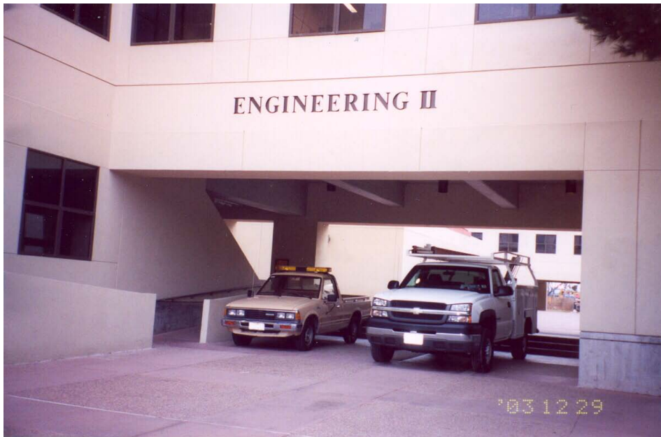
The walkway and steps to the west of Engineering II continue to be used as loading dock in this photo of 2003/12/29.