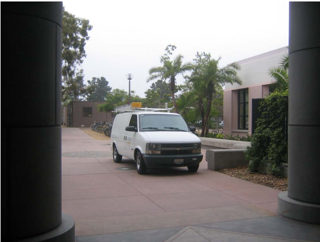
The walkway to the north of the Physical Sciences North building is a favorite parking spot for many vans and trucks (May 24, 2005).