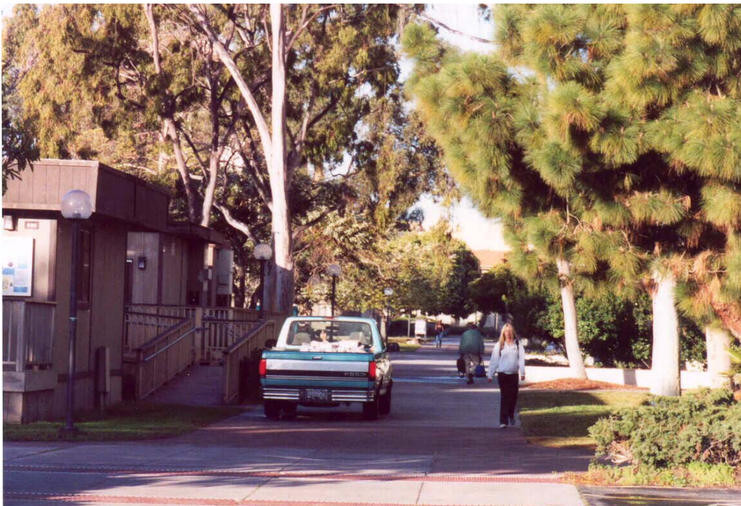
Another shot of the now familiar Daily Nexus distribution truck on the walkway connecting Engineering I to the Davidson Library (sometime between 2004/01/30 to 02/07).