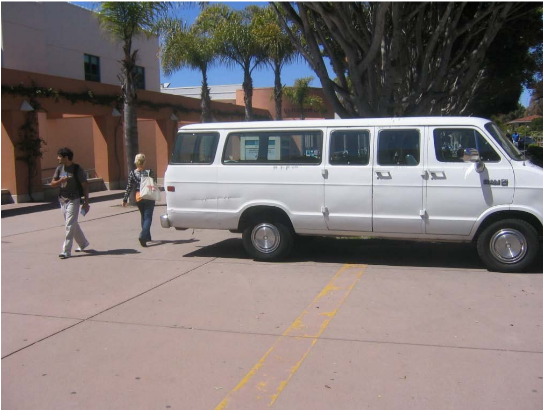
Around noon on April 5, 2005, looking southwest toward the UCen Building. This van is parked on the walkway between the Music Building and UCen. There is a parking area right behind the van and another lot nearby behind the photographer.