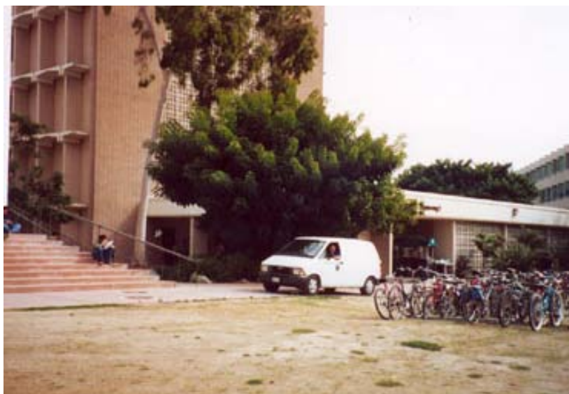
2002/10/18, early afternoon: Van driving on the walkway to the west of Engineering I and MRL.