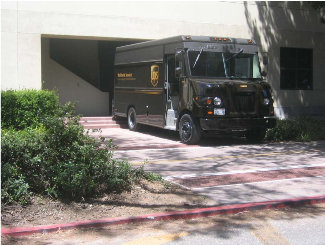
This photo of a parked UPS van, blocking the south pedestrian access to the Engineering II building, was taken in the early afternoon on April 20, 2005. Either campus officials did not inform UPS, which has been parking and driving illegally on campus for years, that this practice is unacceptable or UPS continues to ignore the warnings.