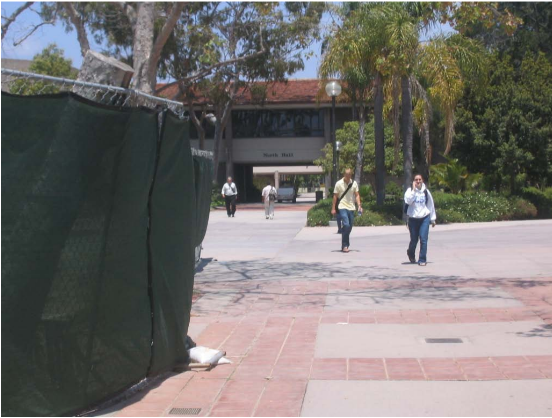
The vehicle described above as it continues through the walkway under North Hall.