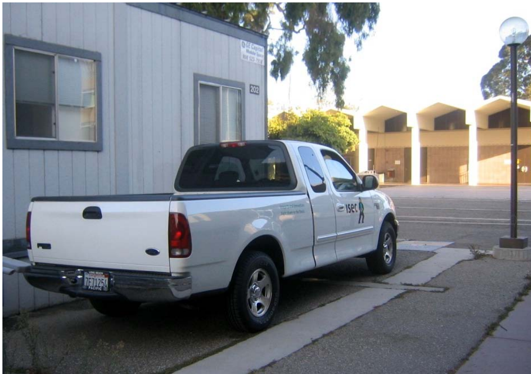
Truck parked next to a temporary building close to the southeast corner of the Chemistry Building, around 8:20 AM on October 11, 2005.