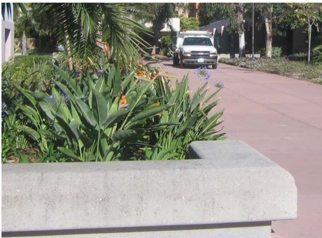
Truck driving on the walkway to the south of Phelps Hall around 8:30 AM on June 7, 2005.