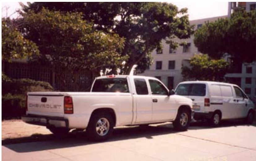
2002/10/18, around noon: Vehicles parked in front of the Engineering Annex (north face of Bren Bldg. is seen in the background).

The following photos of vehicles driving or parking on campus walkways were taken by Professor Parhami during routine walks to classrooms or meetings, with no special effort to catch violators in the act. Thanks are due to Mike Moore for scanning and editing the photos.