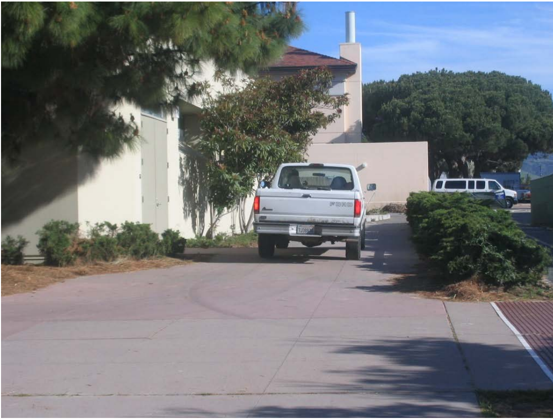
The Daily Nexus distributor leaving the Engineering I area via the walkway to the east of Broida Hall (April 1, 2005).