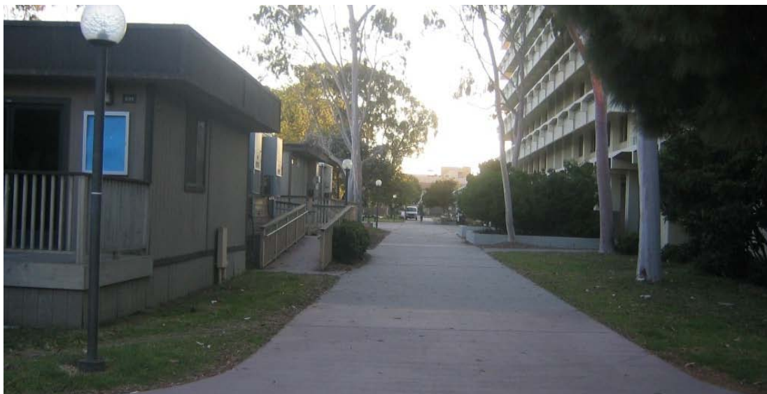
Van parked on the walkway to the south of Broida Hall, around 7:30 PM on June 6, 2005.