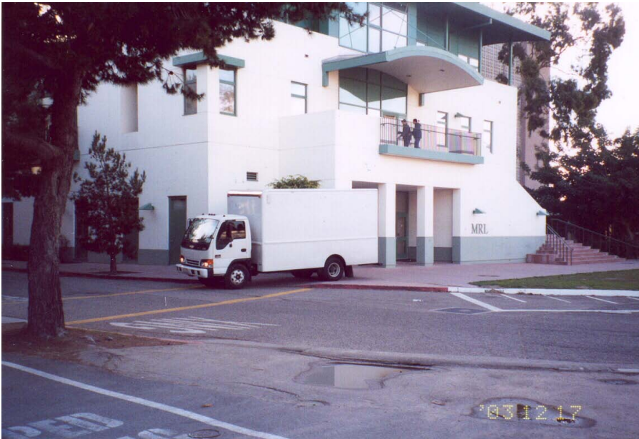
Here is a repeat violator; an unmarked vendor truck jumping the curb on the west side of MRL, after parking on the busy walkway to the west of Engineering I for about 15 minutes.