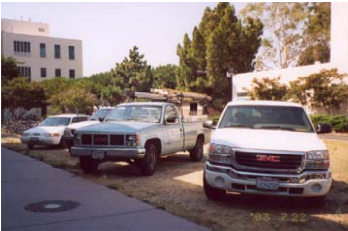
Vehicles parked on the grass to the west of the MRL building on 2003/07/22. Professor Parhami was told a while ago that an official UCSB vehicle parking illegally must display a banner on the dashboard that identifies the unit to which the vehicle belongs and provides a phone number for contact in case of an emergency. None of the vehicles in the previous two photos had such a banner.