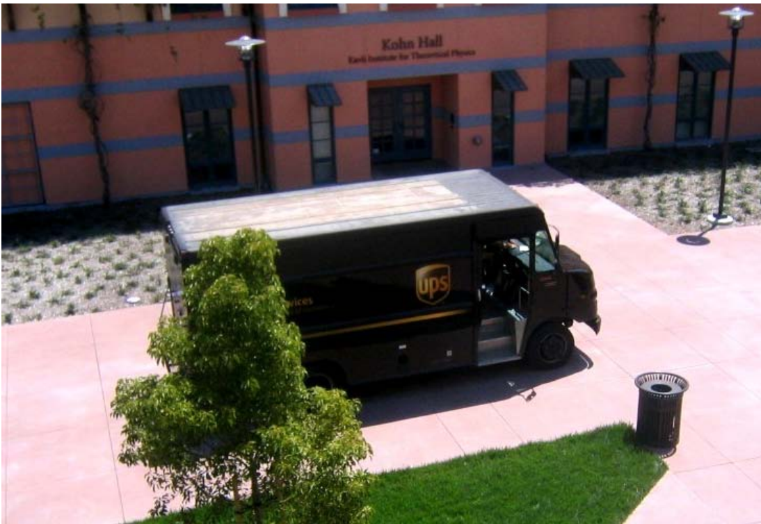
The UPS truck of the previous photo shown as it zips past Kohn Hall on the walkway to its north, around 2:00 PM on 7/21/2006.