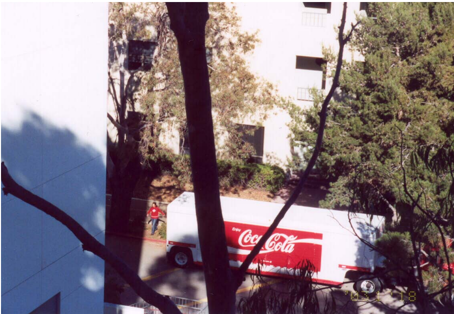
Huge Coca Cola truck seen parked on the south of Engineering II on 2003/12/18, completely blocking a walkway and crosswalk and forcing pedestrians to find their way through bushes and dirt. Again, why can't vendors be asked to use smaller vehicles for campus deliveries?