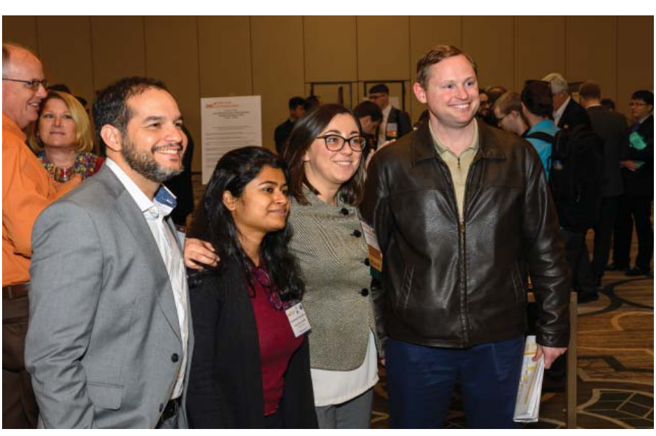
RWW 2020