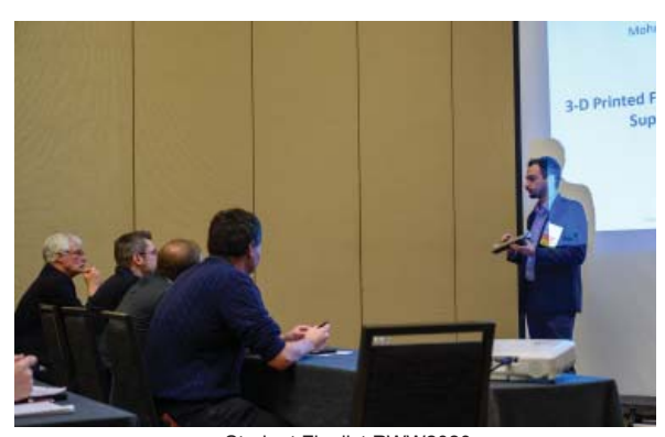
Student Finalist RWW2020